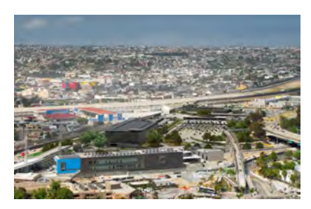
Eastward depiction of the new northbound administrative building