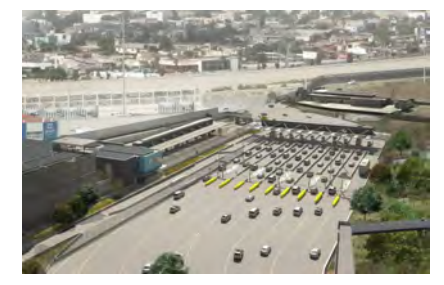
Rendering depicting southwest view of the expanded lanes