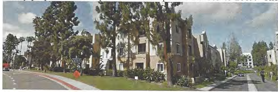
Figure 9. University City multi-family development

Looking further back, in 2006 a large multi-family property was developed in University City. Soon after, the economy and the housing market collapsed. The average citywide depreciation from roughly the peak in 2006 to the valley in 2012 was 25.4%. The neighborhood surrounding this development depreciated at a lower rate than the City as a whole. It only experienced a decline of 17.3%. As noted earlier, the community of University City had the second most for-sale multifamily properties developed in the time period of 2003 to 2009. The continued success of that