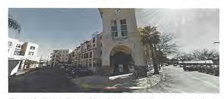
Figure 12. Transit Oriented Development with housing and retail directly adjacent to a trolley stop.

In San Diego, the priority for multi-family development is in what are called transit priority areas. Transit priority areas mean that a major transit stop is within a half mile or ten minute walk.<sup>24</sup> Research has shown that use of public transit increases the closer to main priority public transit lines the property exists.<sup>25</sup> As San Diego pushes to develop more projects along transit lines, the impact experienced on our freeways will be less than if the development were taking place as greenfield projects in East County or North County. Individuals that live in multi-family homes versus single-family homes take 40% less trips.<sup>26</sup> By prioritizing and developing these projects in the right areas, San Diego is able to lessen the traffic impact experienced.