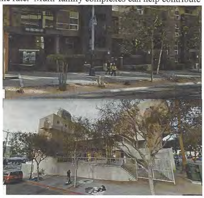
Figure 9. Eyes on the Street Design vs Non Eyes on the Street Design

to a lower crime rate due to the fact that they are dense. This is counter-intuitive to the myth that most people believe. The density of multi-family complexes is actually an asset.<sup>17</sup> Oscar Newman famously termed the concept of defensible space. Defensible space is achieved both through "target hardening," design features that repel criminal activity such as fences, gates, and locks, and through design elements that encourage residents to assert control over their public spaces and neighborhood environments.<sup>18</sup> Modern day multi-family design takes into account this research in the architectural development of the project. The correct usage of design results in a concept of "eyes on the street," which helps deter crime.