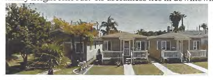
Figure 10. Ocean Beach bungalows

Density and multi-family developments come in all shapes and sizes. While a skyscraper or multistory apartment complex is a style that is developed, it is not effective or useful in single-family neighborhoods. Its usefulness lies in downtowns and other dense transit corridors. Density