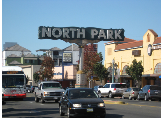
The North Park community has the benefit of having four business district organizations looking after the success of its commercial areas.