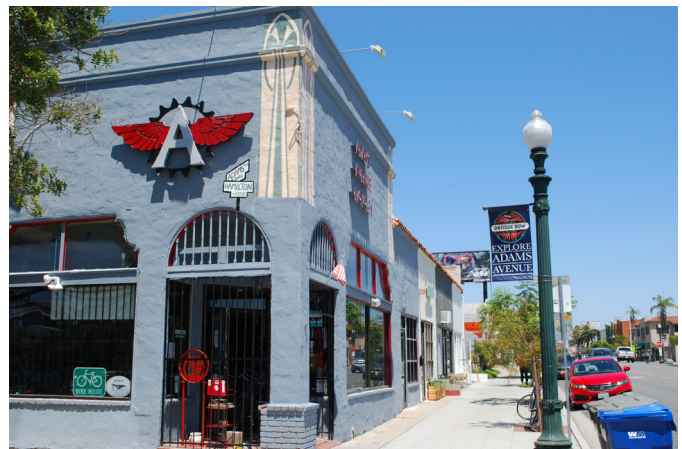
The Adams Avenue Business Improvement District which runs through Normal Heights, Kensington, Antique Row, and University Heights annually plays host to the Adams Avenue Street Fair and Adams Avenue Unplugged which are the City's largest free music festivals.