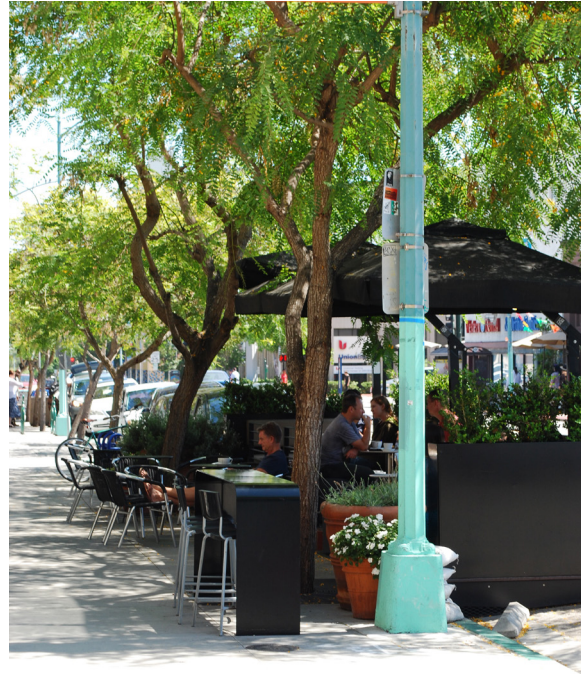
Parklets are an innovative way to transform parking into unique gathering spaces within commercial districts. The City's first parklet is located at 30th Street and University Avenue.