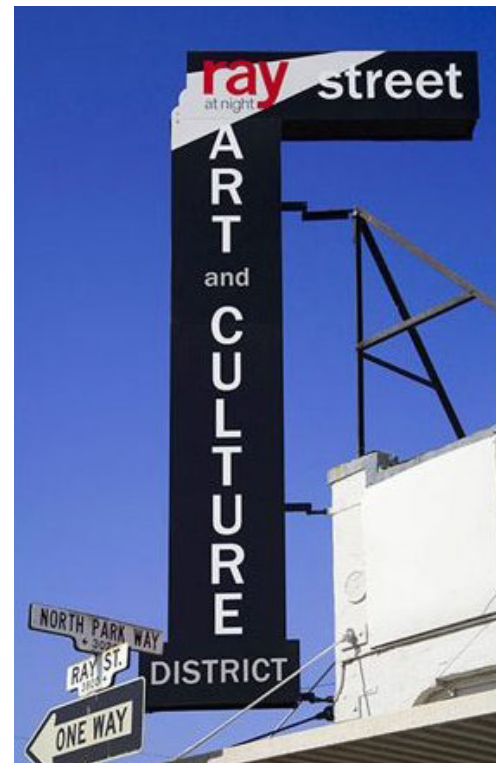
The growth and popularity of North Park's art, culture, and entertainment district has been major a contributing factor in North Park's revitalization.