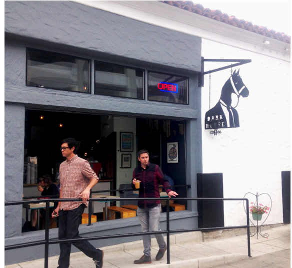
Older buildings can be retrofitted to create new indoor-outdoor experiences.