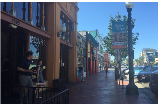
North Park's commercial areas provide pedestrian-oriented storefronts.

The historic resources in North Park provide a sense of place. Throughout the Economic Prosperity Element there are policies that relate to the historic resources in North Park. North Park contains multiple designated historic resources and 4 designated historic districts – Shirley Ann Place, University Heights Water Storage and Pumping Station, and the Burlingame and North Park Dryden neighborhoods. Refer to the Historic Preservation Element for more information about historic resources in North Park and designated and potential historic districts.