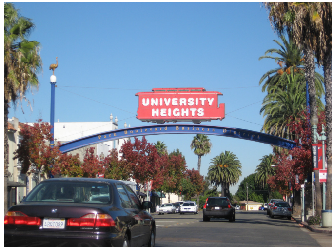
The University Heights – Park Boulevard Business District is shared by both the North Park and Uptown communities.