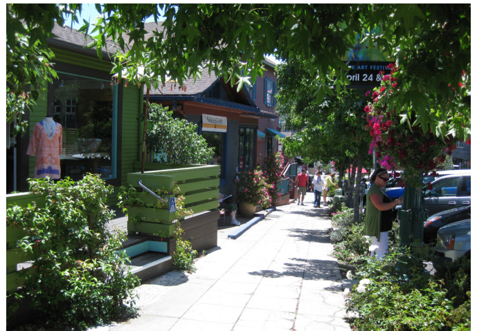
Street trees and landscaping can be a major economic generator for commercial districts by attracting pedestrians.