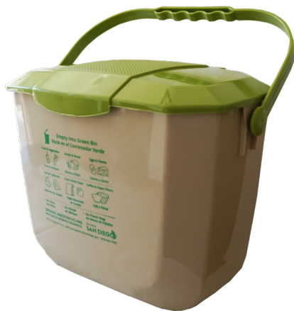
Kitchen Pail – INDOORS