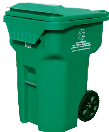
Green Bin – OUTDOORS