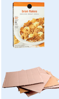
Mixed Paper and Shredded Paper (shredded paper must be in a paper bag)