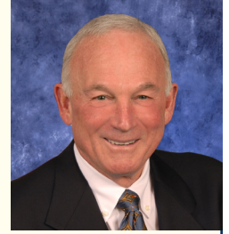
Mayor Jerry Sanders

Creating and retaining jobs is a critical part of weathering the current economic storm. The City of San Diego is working with local businesses, trade groups and other government agencies to implement strategies for job development.