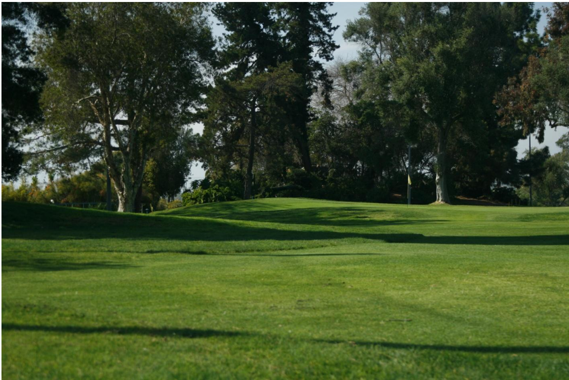
(3 rd hole at Mission Bay Golf Course)

It holds a unique position in the local golf market as the only night-lighted golf course and practice facility. The course layout and practice facilities make it an ideal venue for beginners, seniors and families. With improvements to the driving range, clubhouse and course infrastructure, Mission Bay should once again become an ideal destination for locals and visitors.