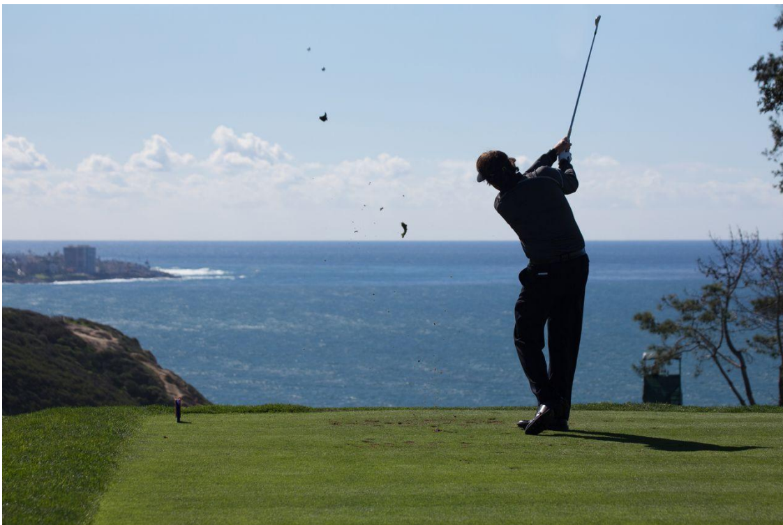
(Phil Mickelson during the 2013 Farmers Insurance Open)

With only a small increase in percentage of rounds needed to obtain the annual target of 146,800, (64,000 for the South Course and 82,800 for the North Course), the goals and objectives of Torrey Pines are more one of refinement than increasing the total number of rounds.