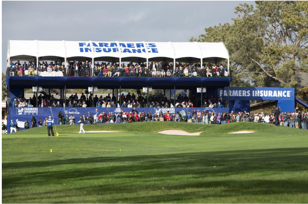
(2013 Farmers Insurance Open)