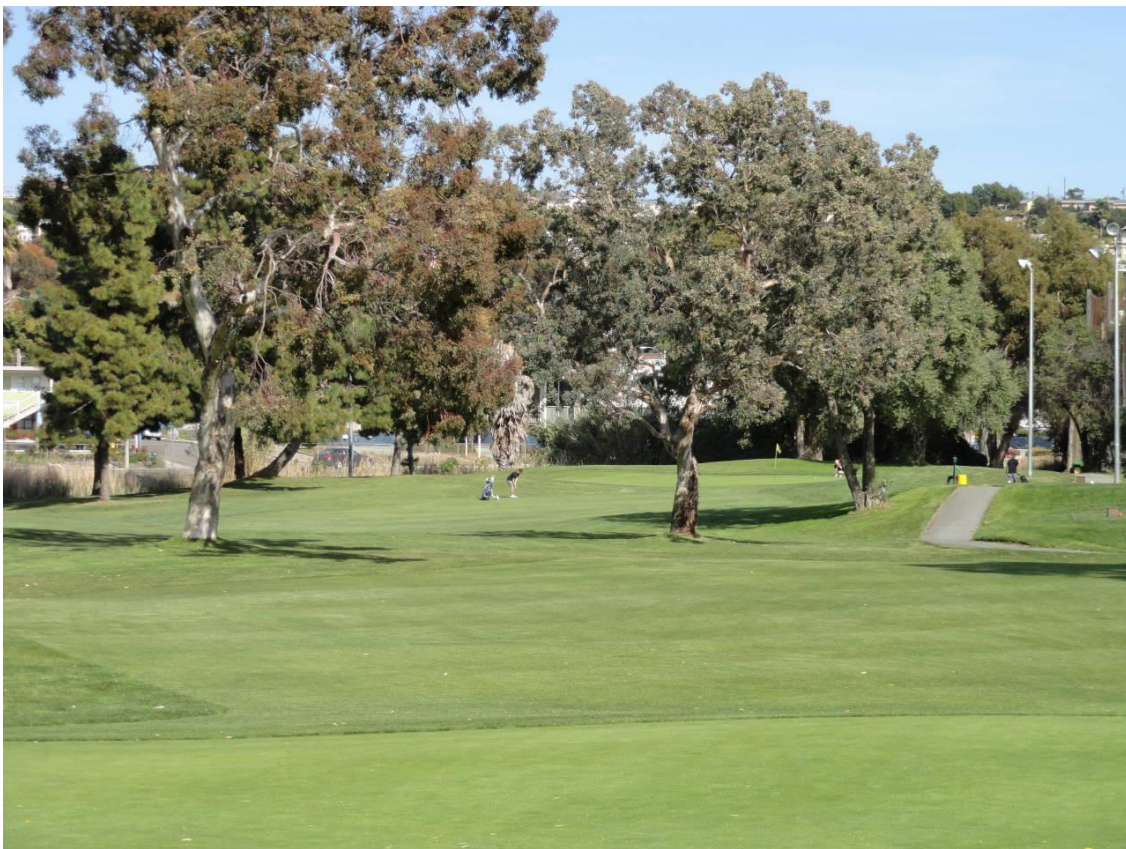
(View from 9 green at Mission Bay Golf Course)