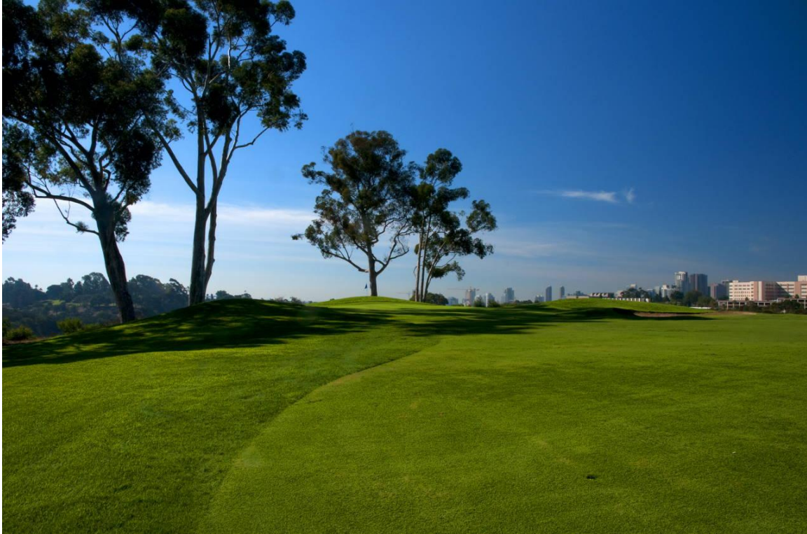
(14 th hole at Balboa Park Golf Course)

Prior to projects moving from the “Future” to “Current” lists, staff will work to refine the scope and goals for the project. Formal creation of new projects will occur through the budget process for new published CIP projects and others will be outlined in the annual review of the Golf Division presented to the Park and Recreation Board.