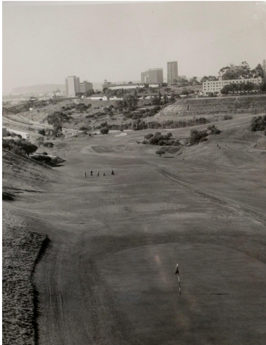
(18th Hole at Balboa Park Golf Course circa 1945)

Recent work on the courses has them in excellent agronomic condition and they will continue to improve through diligent maintenance practices. These efforts have also enhanced one of the key features of this landmark facility, the panoramic views of the downtown skyline, Pt. Loma and beyond. As golf course conditions have improved and the number of rounds have increased, tournament and