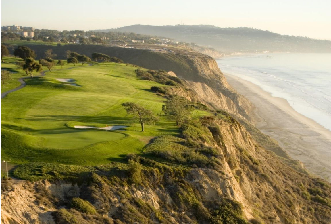
(4 th Hole on Torrey Pines South)

While the North Course has not obtained the same status as that of South, it continues to be an outstanding golf course in its own right. With its beautiful location on the coastline bluffs, the course has magnificent shoreline-views, PGA Tour history, a loyal resident clientele and a challenging, yet player friendly course design.