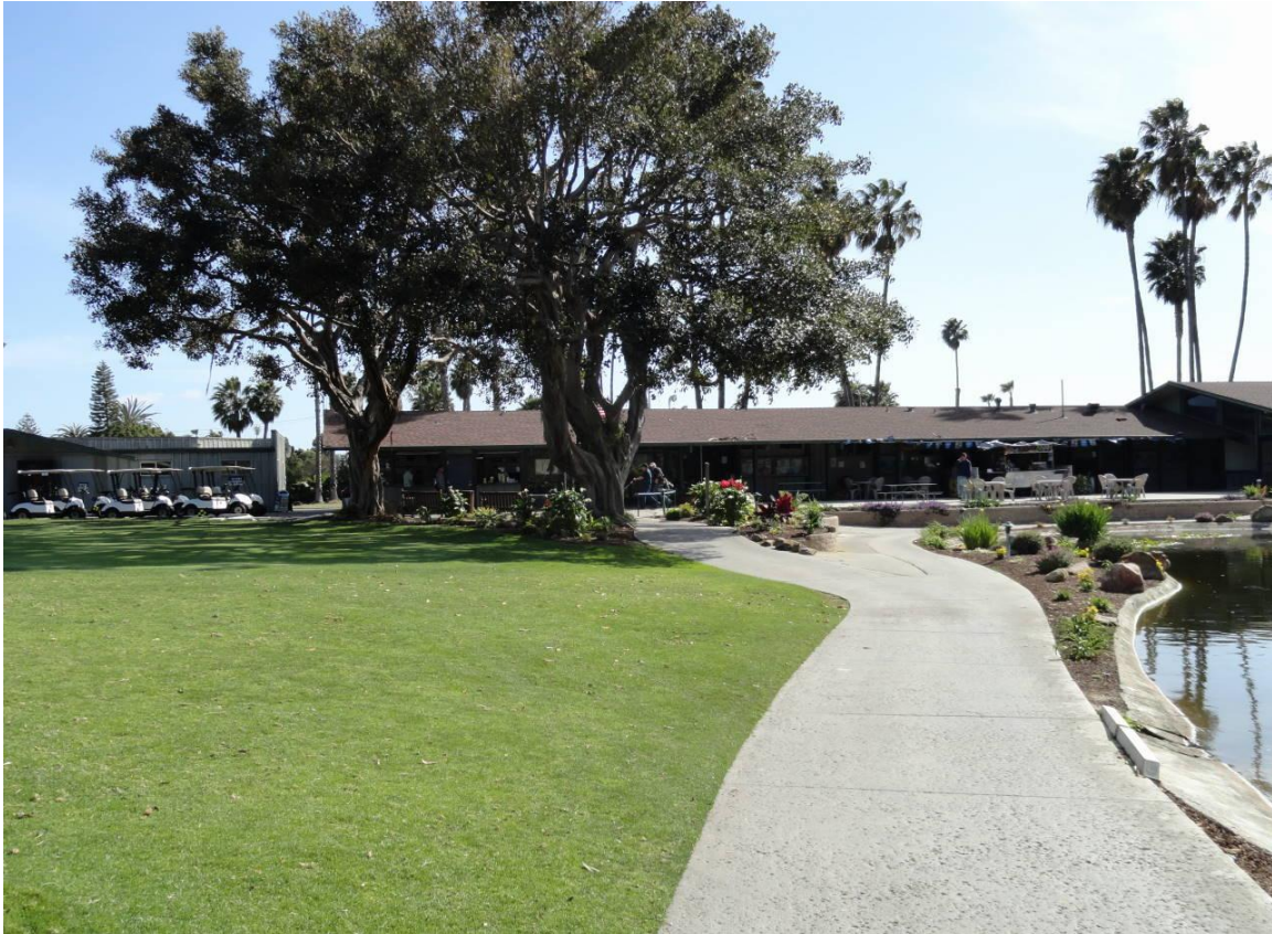
(Mission Bay Club House)

Prior to projects moving from the “Future” to “Current” lists, staff will work to refine the scope and goals. Formal creation of new projects will occur through the budget process for new published CIP projects and others will be outlined in the annual review presented to the Park and Recreation Board.