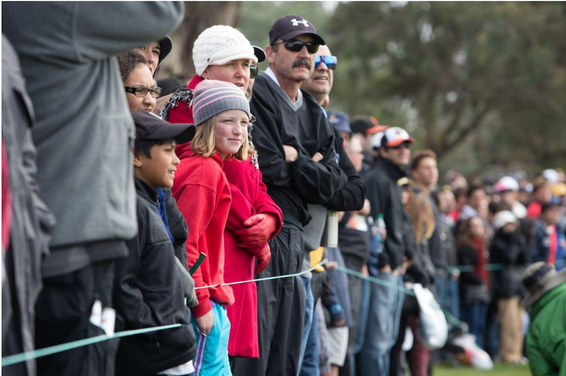
(2013 Farmers Insurance Open)

Resident Access: As in the past Business Plan, providing Resident access to tee times remains a high priority. Among the three City golf complexes, only at Torrey Pines is Resident access a concern. At Torrey Pines, the annual goal is to provide Residents with access to 70% of the available tee times. If and when needed at the other two complexes, a mechanism would be created to ensure continued Resident access.