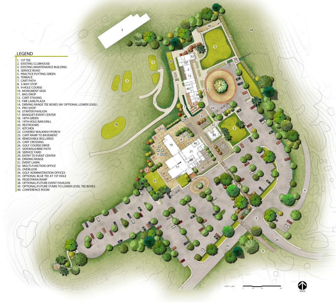
(Schematic Design for the Balboa Park Golf Course Master Plan)