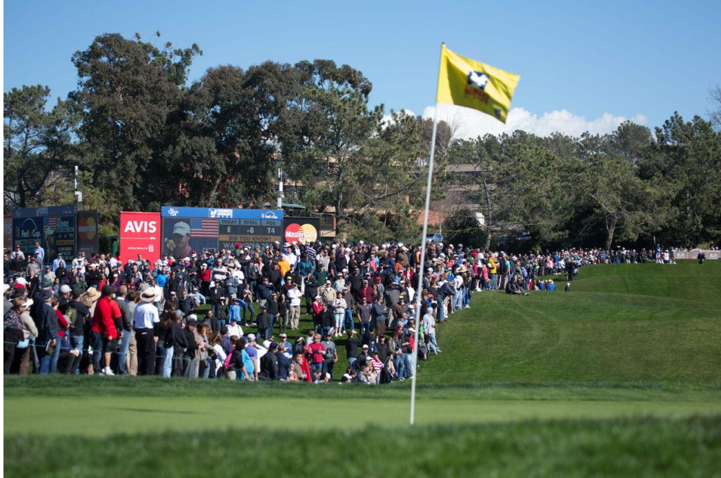
(2013 Farmers Insurance Open)

promotional/marketing value and decide whether the fees can be reduced in accordance with the approach to flexibility. Examples of these events could be: CIF Tournaments and Championships, Collegiate Tournaments, California State Amateur, Publinks events, etc.