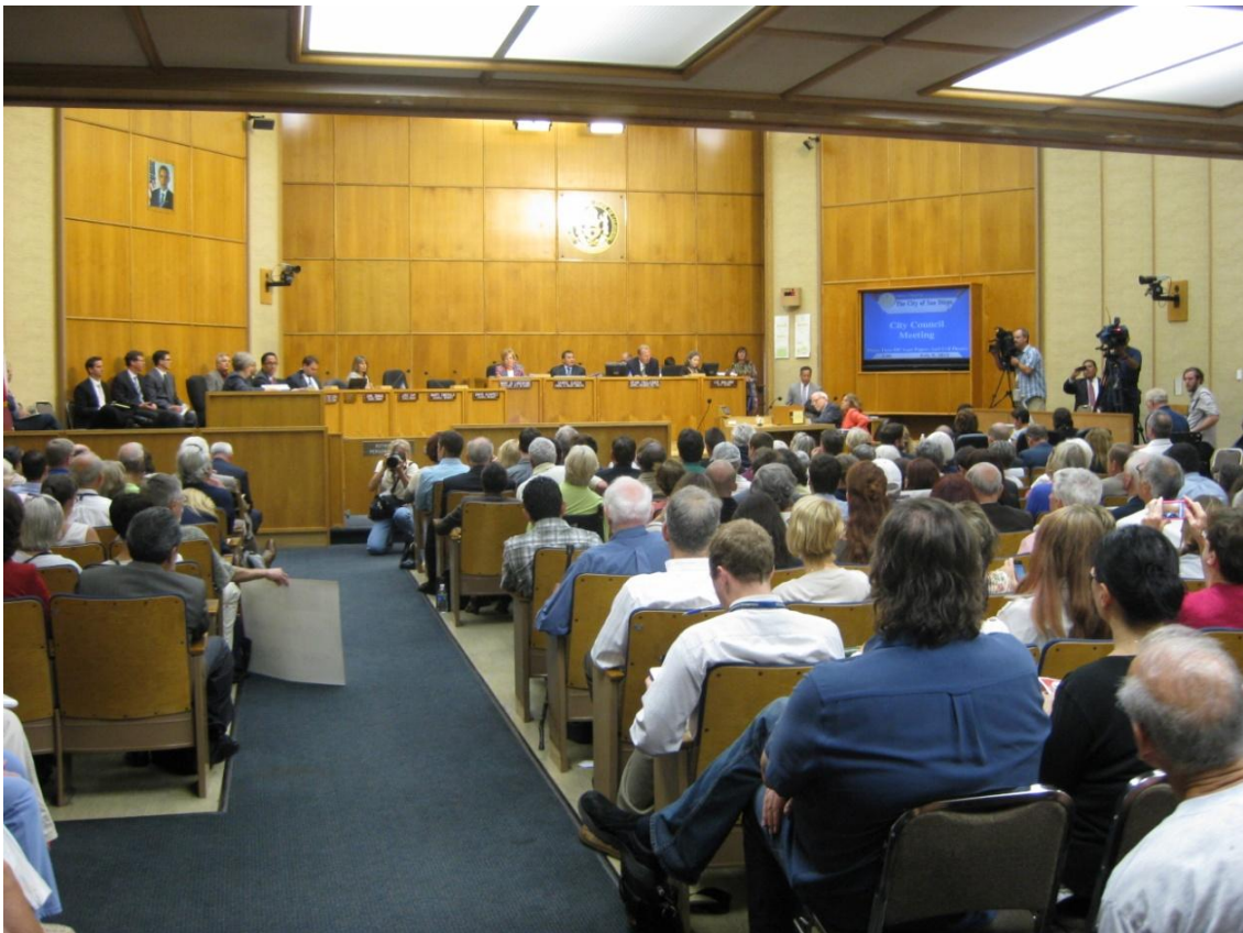
(San Diego City Council Meeting)

The first six (6) community meetings focused on reviewing each of the critical Business Plan elements. At meeting seven (7), community members were invited to participate in a workshop designed to allow for open dialog on any of the previously covered elements and topics. Meetings eight (8) and nine (9) refined these elements as discussed in previous meetings and focused on questions arising from meeting seven (7).