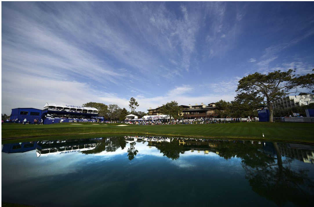
(2013 Farmers Insurance Open)

The yearly telecast draws millions of worldwide viewers and brings a great deal of attention to America's Finest City, its weather, visitor resources and of course, the seaside bluffs of Torrey Pines. There is no mistaking the positive impact that the Century Club, in conjunction with the Golf Division, has on the San Diego region by bringing the PGA event to Torrey Pines annually. The Golf Division continues to improve this relationship in the years to come and strives to create golf complexes that continue to be attractive to professional tournaments and special events.