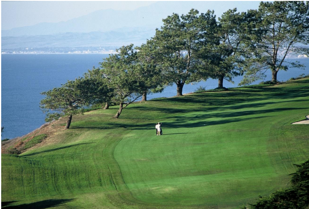
(7 th hole on Torrey Pines North)

It is also felt that the changes described in the Marketing section will be enough to keep Torrey Pines on its upward trend. However, if this trend doesn't continue and the economy or golf industry suffers additional unpredictable declines, it will require the flexibility to adjust to market trends.