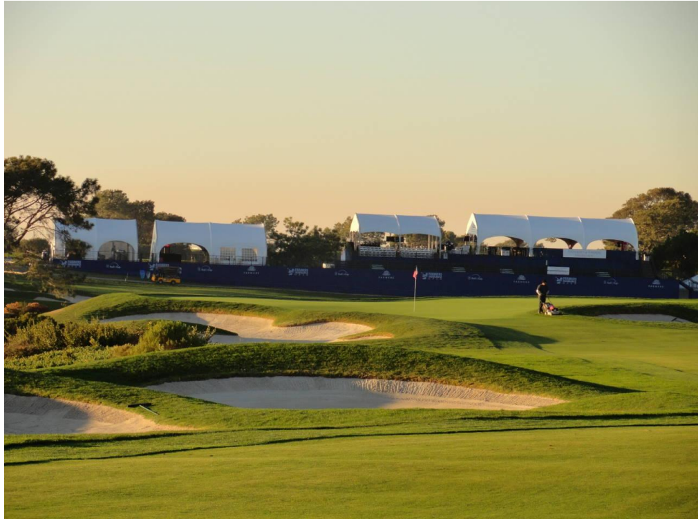
(Preparation for the 2013 Farmers Insurance Open)