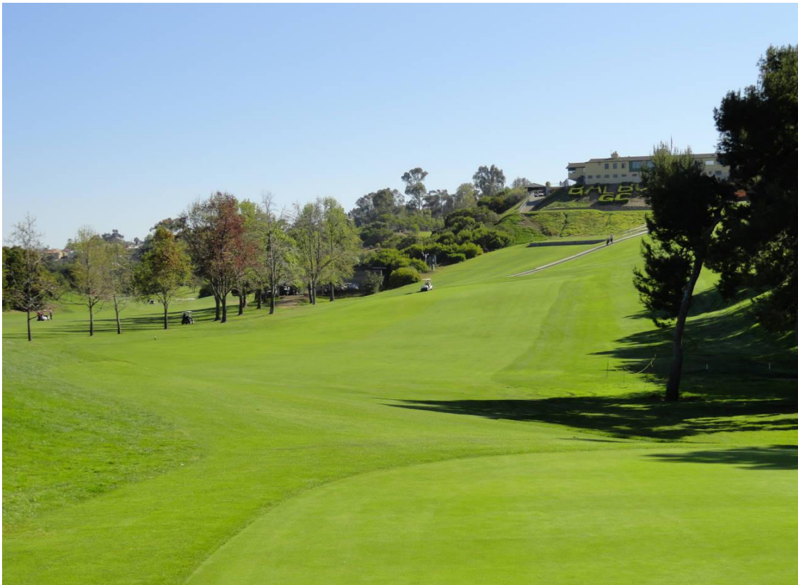
(1 st hole at Balboa Park Golf Course circa 2012)

The proximity to downtown offers an excellent opportunity to develop relationships and marketing programs by targeting hotels, various conventions, businesses and the growing residential population. There is also plan to increase our participation in Balboa Park partnerships and activities to maximize all marketing opportunities and create an overall presence in the Balboa Park system. These goals will be most effective after: renovation/construction of a clubhouse; efforts by staff to solicit and manage tournament play; establishment of clearly defined marketing strategies; and the flexibility of Golf Operations to implement fee strategies to improve the number of rounds and overall revenues.