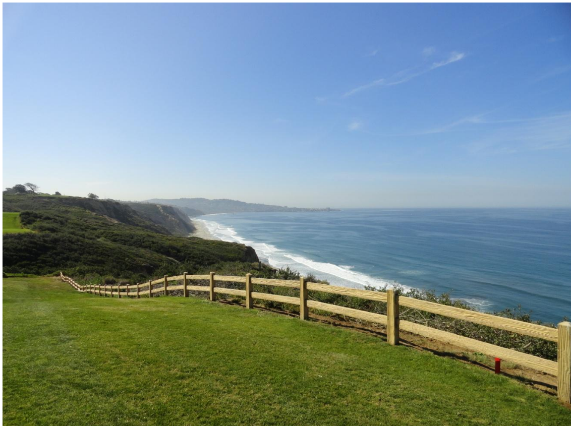
(7 th Hole on Torrey Pines North)

As part of the review of each complex in this document we have a CIP Five-Year Plan, Appendix C that lists capital improvement projects planned for each facility. This plan will be updated as part of the City's annual CIP process. These lists will be re-evaluated by the Golf Division and Public Works Department on a regular basis to ensure that the projects meet the needs of the patrons, as well as improve site conditions, operations