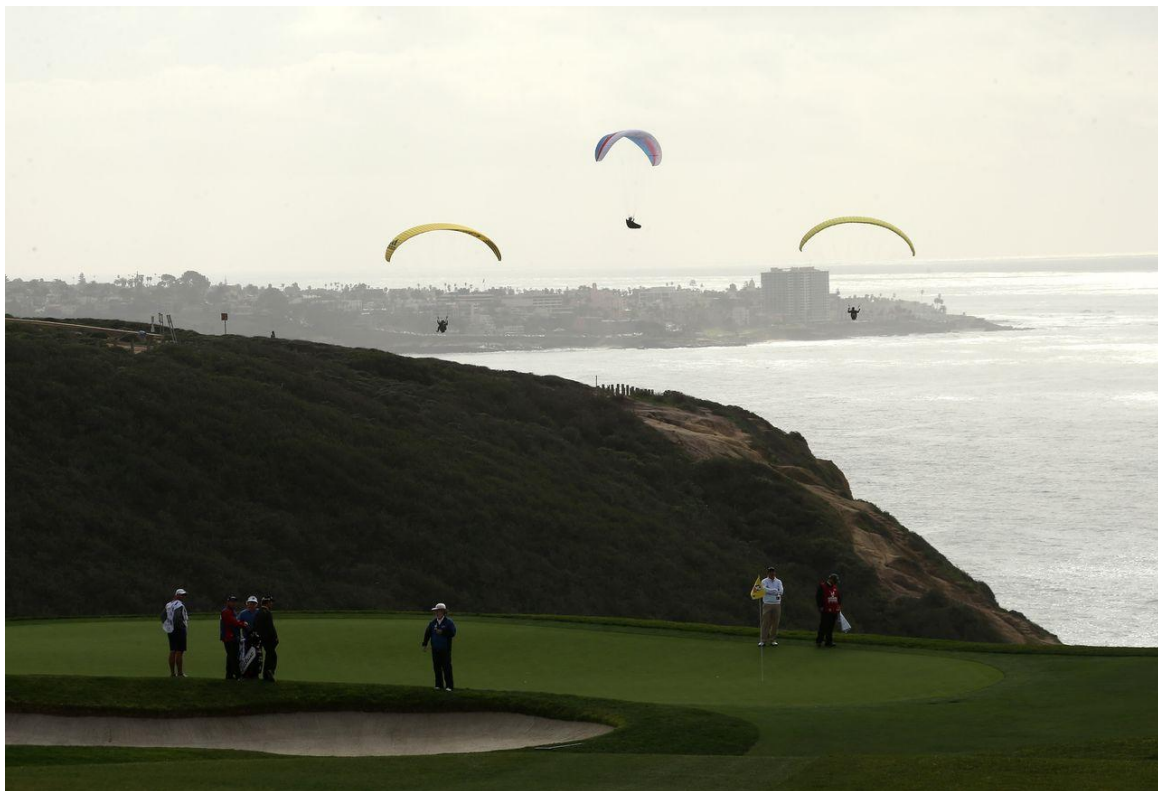
(3 rd Hole on Torrey Pines South)

In 2001, the South Course was redesigned by world-renowned architect Rees Jones and was immediately awarded the 2008 United States Open Golf Championship. Commonly referred to by most as one of the most exciting and successful in history, the 2008 US Open Championship was not only an historic competitive event for golf, but it put Torrey Pines South Course on the worldwide radar as a “must play” golf venue.