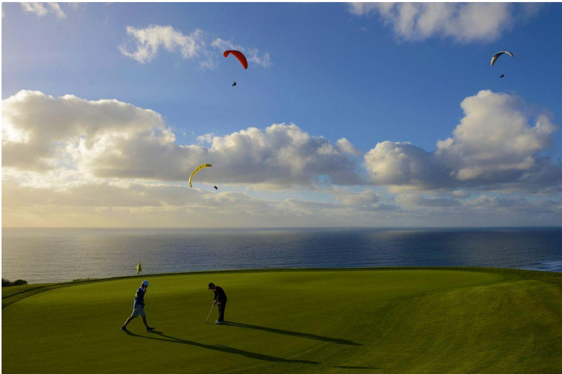
(4 th Hole on Torrey Pines South)

2012 Golfweek – “Best Municipal Golf Course”