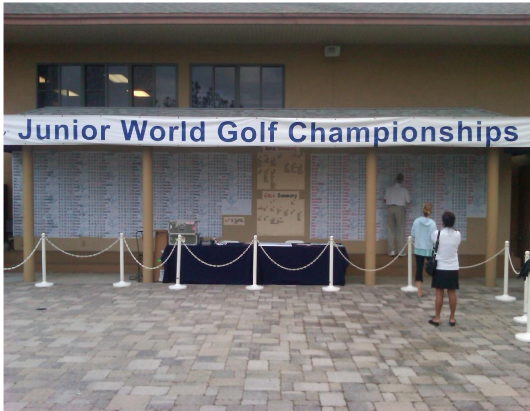
(Scoreboard for the Junior World Golf Championships)

schools throughout the year. The San Diego Junior Golf Association holds numerous events at our City Golf Complexes and each July, Torrey Pines hosts the Callaway Junior World Golf Championships. As the host course for the 15-17 year-old boys and girls it is the largest junior tournament in the world attracting over 1,100 players from 54 countries and 42 states.