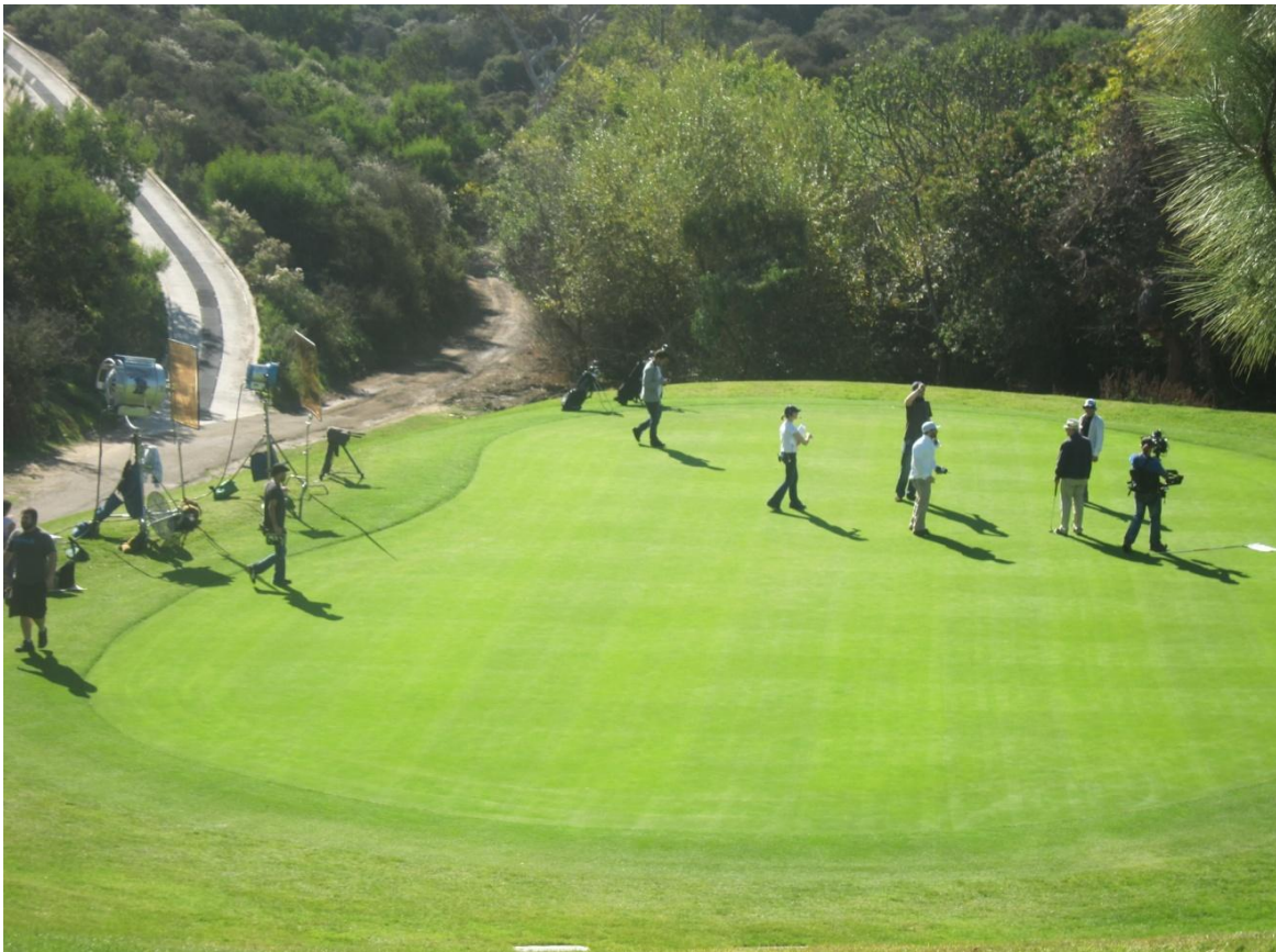
(Film Shoot at Balboa Park Golf Course in 2011)

Due in part to the majestic views the City of San Diego operated golf complexes continue to be popular for photo and film shoots. The staff continues to receive numerous requests to use the golf courses for this purpose. Many of these activities can be beneficial to the City of San Diego's visibility and image as a premier golfing destination.