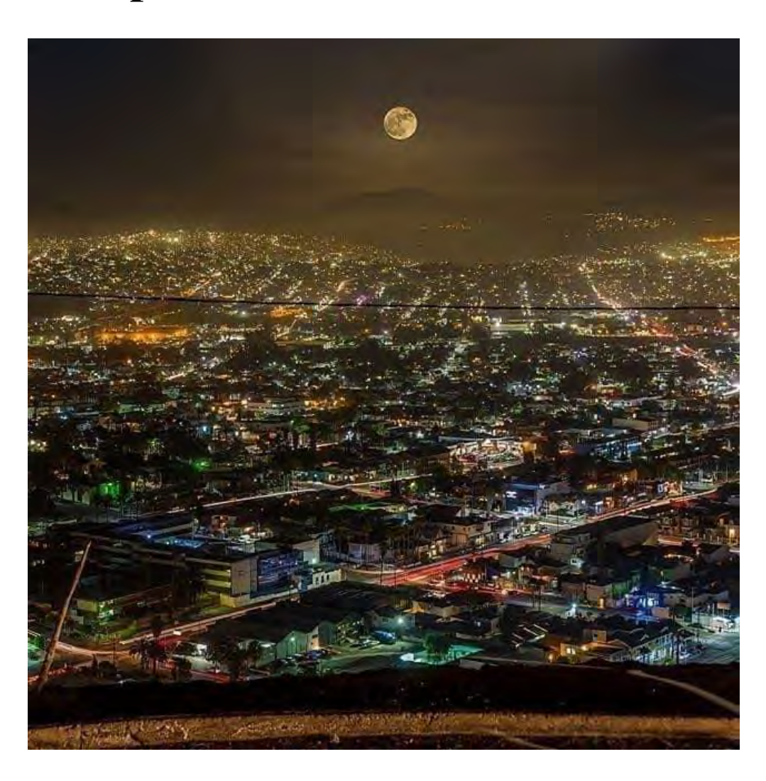
Tijuana, B.C., Mex. - San Ysidro, CA, USA