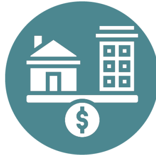
HOUSING AND COMMUNITY DEVELOPMENT

The Root Policy Team has worked on over 300 projects in 35 states.