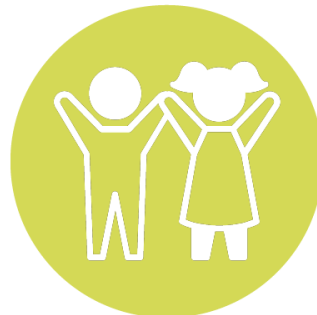
CHILD CARE AND EDUCATION