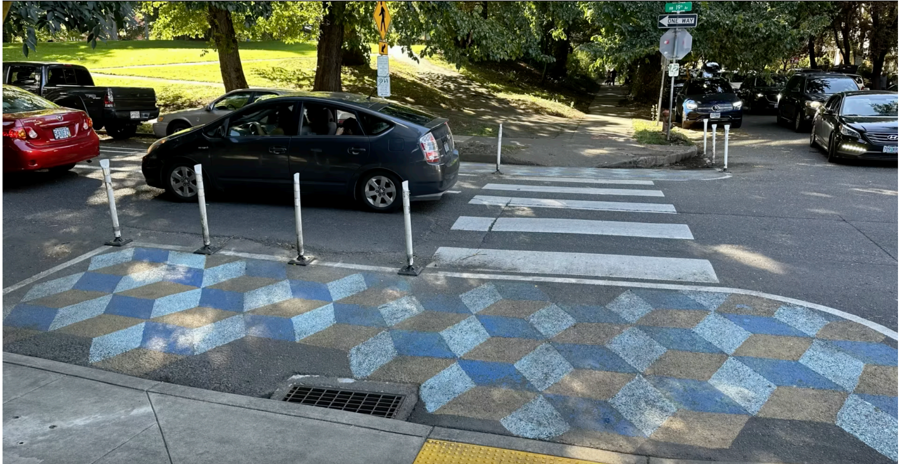
Quick build daylighting in Portland, Oregon