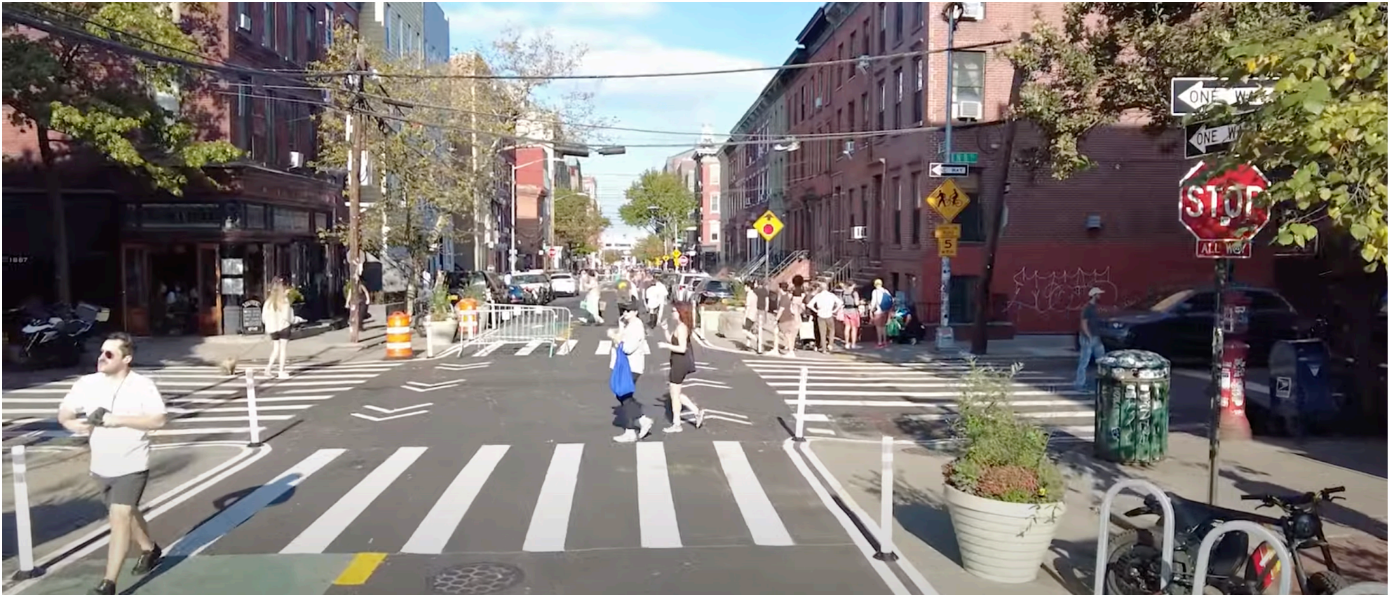
Quick build daylighting in Brooklyn, NY