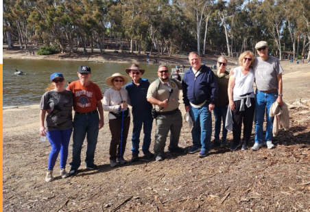
Park Ranger-led walk at Chollas Lake