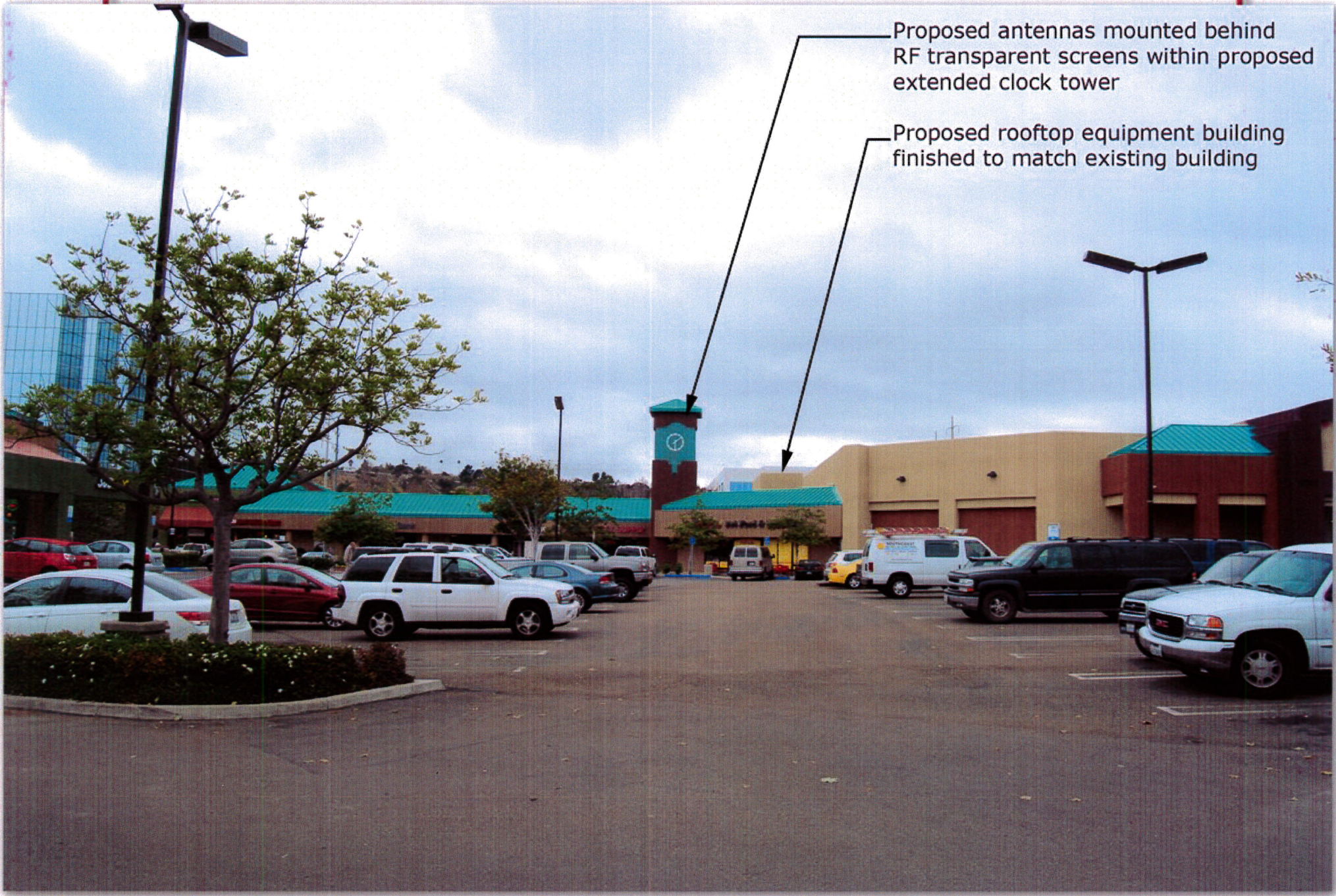
Photosimulation of proposed telecommunications site