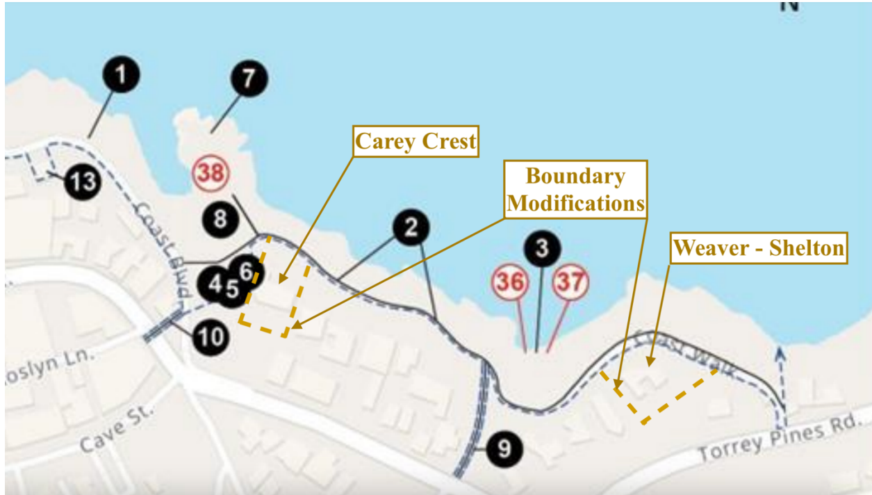
Suggested modifications to district boundary lines (Excerpt from Nomination Sketch Map 1 of 2: North, sheet 9-67)