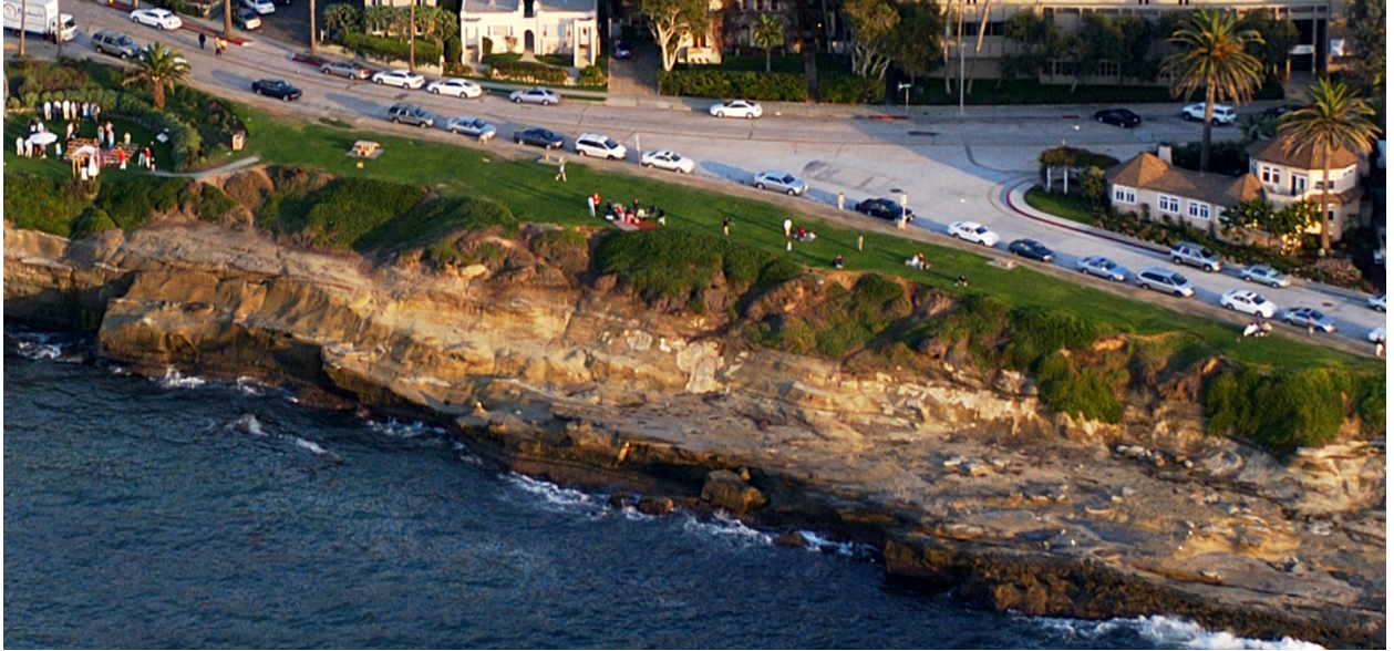
VIEW FROM WEST – California Coastal Records Project Image #

NOTE: Contributing Structure. #34. Cobble Drain Outlet , NR Form Sheet 9-65, 9-68 & 9-98, Photo #32 is located approximately 350 feet northeast of the Lampshade House.