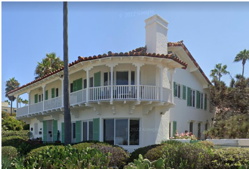
Dr. Figueredo Building , 417 Coast Boulevard, La Jolla CA 92037 Google Map Street - View from Southwest

See San Diego Historical Resources Board REPORT NO. HRB-12-077, November 29, 2012.