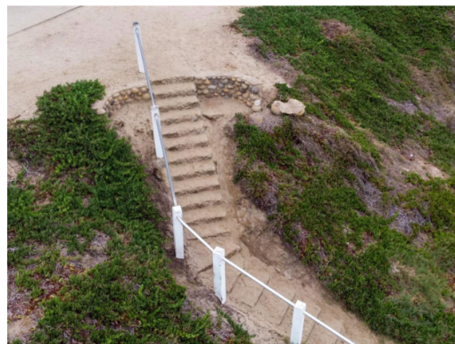
Photo 33 Whale View Point Stairs, camera facing south

La Jolla Park Coastal Historic District Name of Property