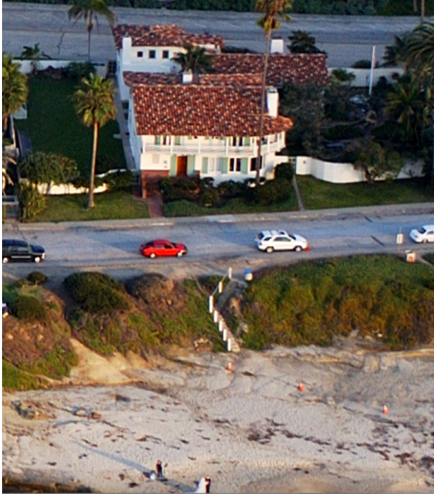
VIEW FROM NORTHWEST

La Jolla Park Coastal Historic District Name of Property