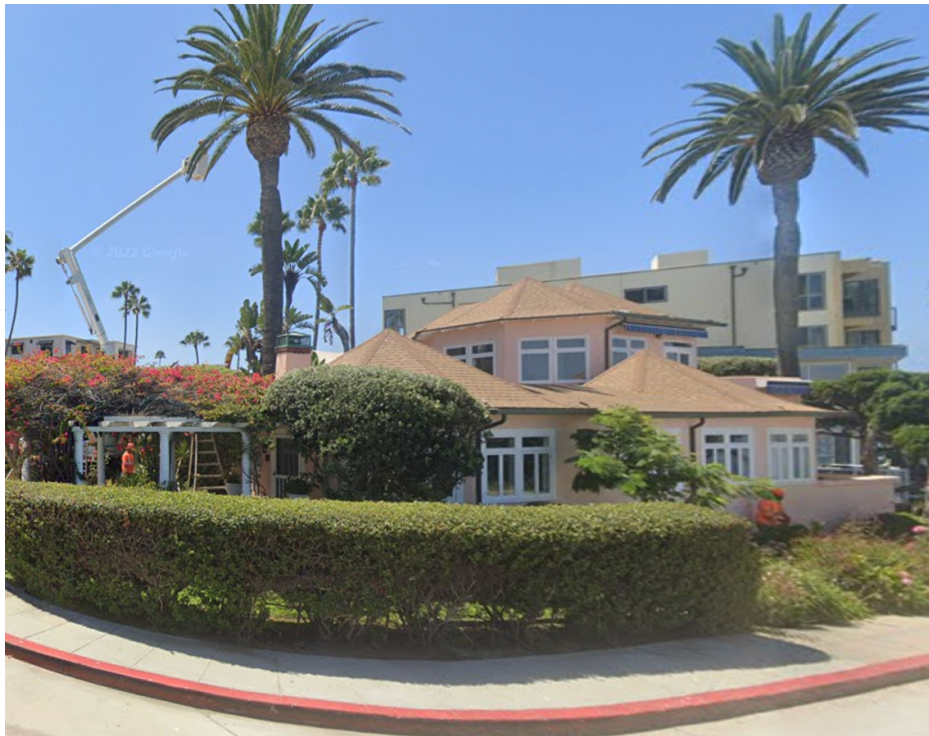
“Lampshade” House, 524 Coast Blvd., South, La Jolla, CA 92037 Google Map Street - View from Northeast

See San Diego Historical Resources Board REPORT NO. HRB-12-058, October 25, 2013.