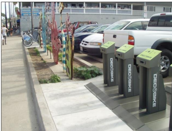
DecoBike station next to the beach in Ocean Beach

To succeed in San Diego, bikesharing needs access to all these locations, but DecoBike has run into obstacles at all of them. For example, while kiosks are located throughout the urban core, they are not co-located with transit stops, which is crucial to the program's