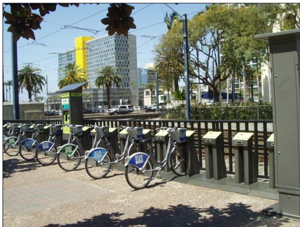
Bikesharing station on Broadway in downtown San Diego

The City of San Diego’s 2013 Bicycle Master Plan calls for a bikesharing program to offer cyclists the opportunity to rent a bicycle from an unattended docking station, ride it wherever they want within the network, and return it to any station with an open dock. Bikesharing offers affordable access to bikes for short-distance trips in urban areas, connecting employment, transit stops, commercial districts, and local attractions. It is a green program, helping to reduce traffic congestion, noise, and air pollution, while promoting public health.