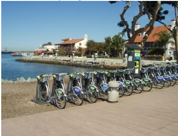
Bikeshare station at Embarcadero Marina Park North

Research in cities with established bikesharing programs shows that they improve public awareness of cycling as a transportation alternative and thus increase overall bicycle use.