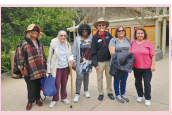
Unleashing their wild side at the Safari Park! February has free admissions for those 60+!