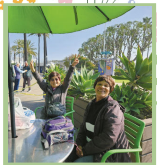
Having a blast with friends on the quarterly AgeWell Services Trip! For more info on trips, see pg. 15.