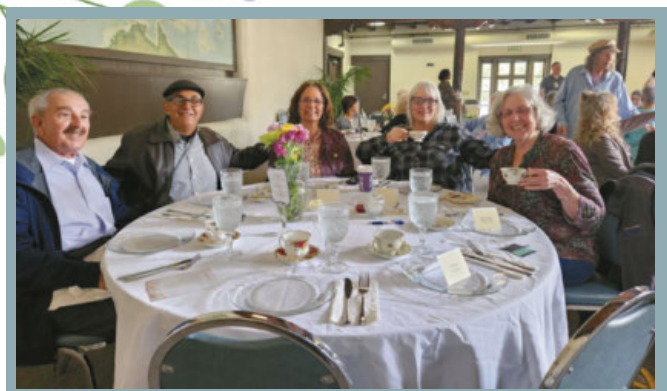
A few of our many volunteers who attended the annual volunteer appreciation celebration. Thank you for all that you do for AgeWell Services!