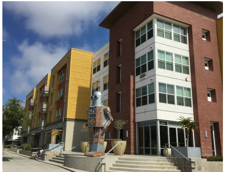
COMM22 in Logan Heights combines affordable family and senior rental housing, with 13 units designated for underserved transition-age youth with mental illness.

California laws have the same protections as federal law and further protect against housing discrimination on the basis of sexual orientation, source of income including rental assistance programs, marital status, age, ancestry, medical condition, genetic information, gender identity, gender expression, arbitrary status includes citizenship, primary language, and immigration status, and military/veteran status. Race in California includes hair texture and style.