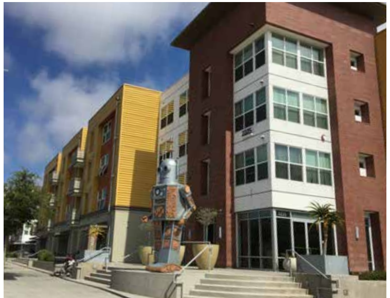
COMM22 in Logan Heights combines affordable family and senior rental housing, with 13 units designated for underserved transition-age youth with mental illness.

California laws have the same protections as federal law and further protect against housing discrimination on the basis of sexual orientation, source of income including rental assistance programs, marital status, age, ancestry, medical condition, genetic information, gender identity, gender expression, arbitrary status includes citizenship, primary language, and immigration status, and military/veteran status. Race in California includes hair texture and style.