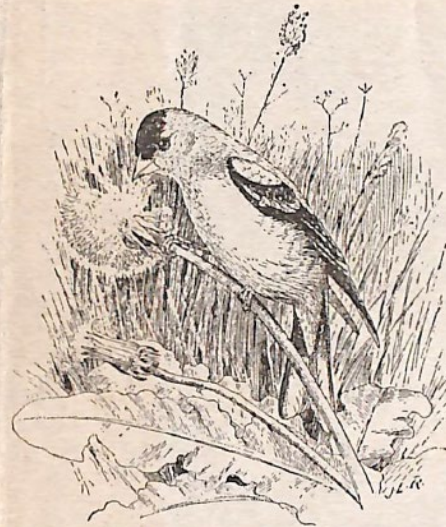
FIG. 1.—Goldfinch or "wild canary," a valuable native song bird.