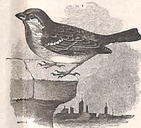
FIG. 2.—European house sparrow, or "English sparrow," an undesirable introduced species.