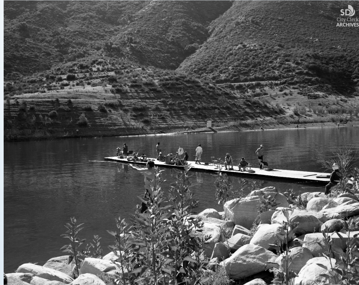
El Capitan Dam, opening day March 28, 1968.