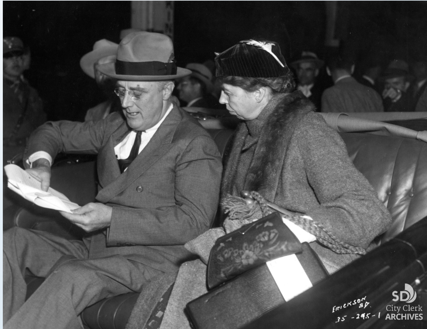
Then President Franklin D. Roosevelt and First Lady Eleanor Roosevelt at the 1935 Expo.