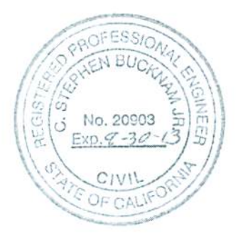
Koppel & Gruber Public Finance