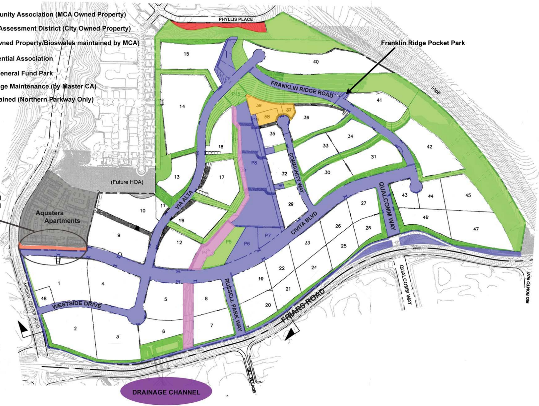
FIGURE 2 - Improvement/Service Areas