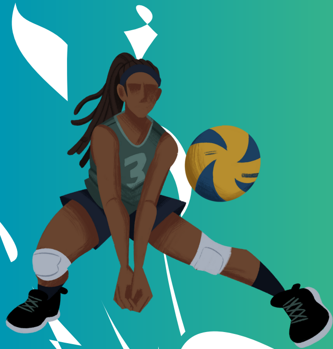
Photo ID / Picture