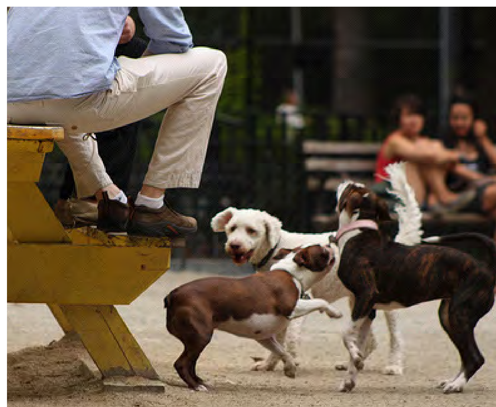
Decomposed Granite Dog Park