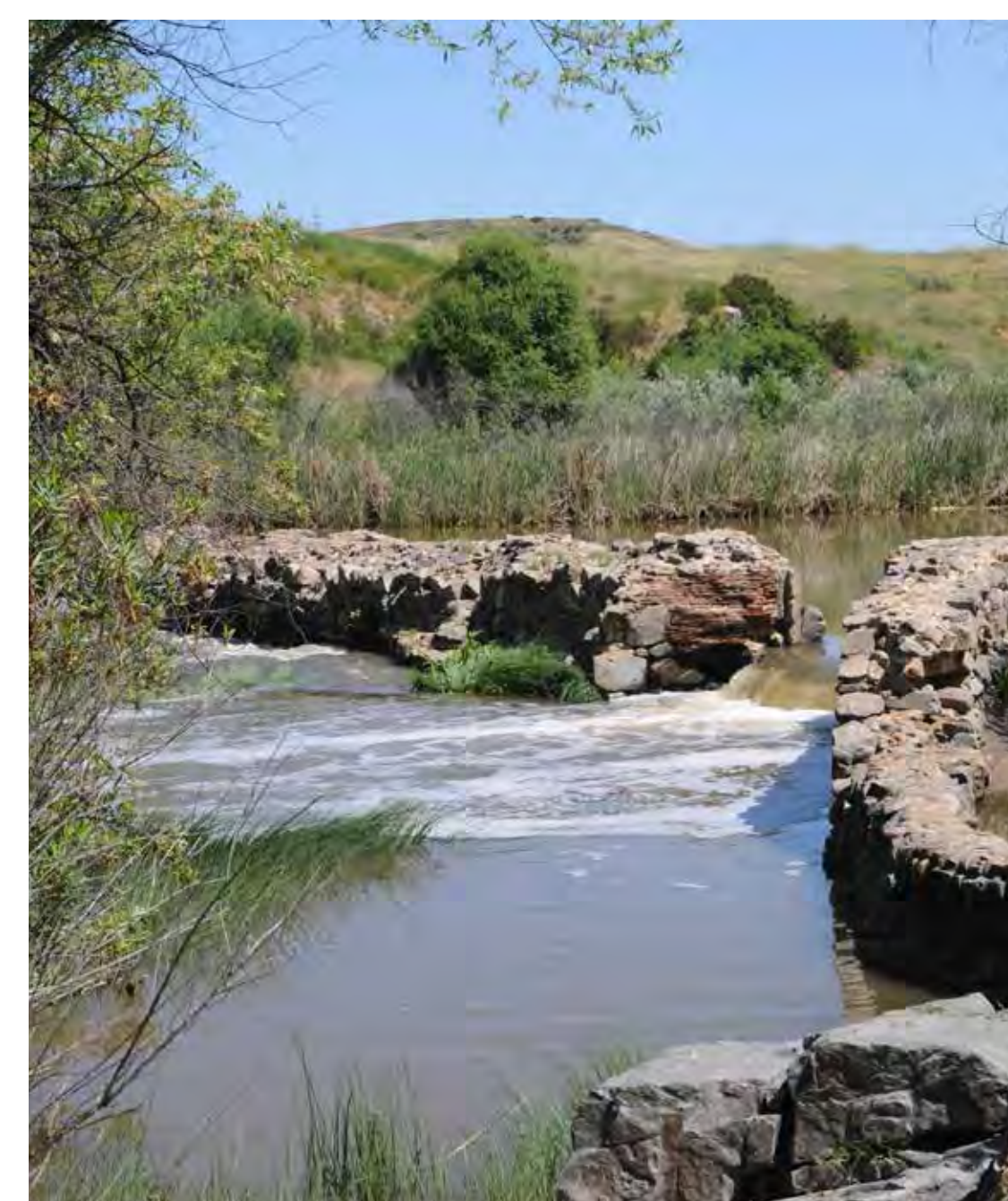
Historic Mission Dam Precedent