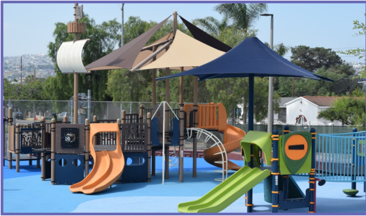
"We Provide Healthy, Sustainable, and Enriching Environments for All"