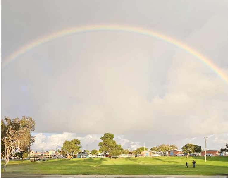
"We Provide Healthy, Sustainable, and Enriching Environments for All"