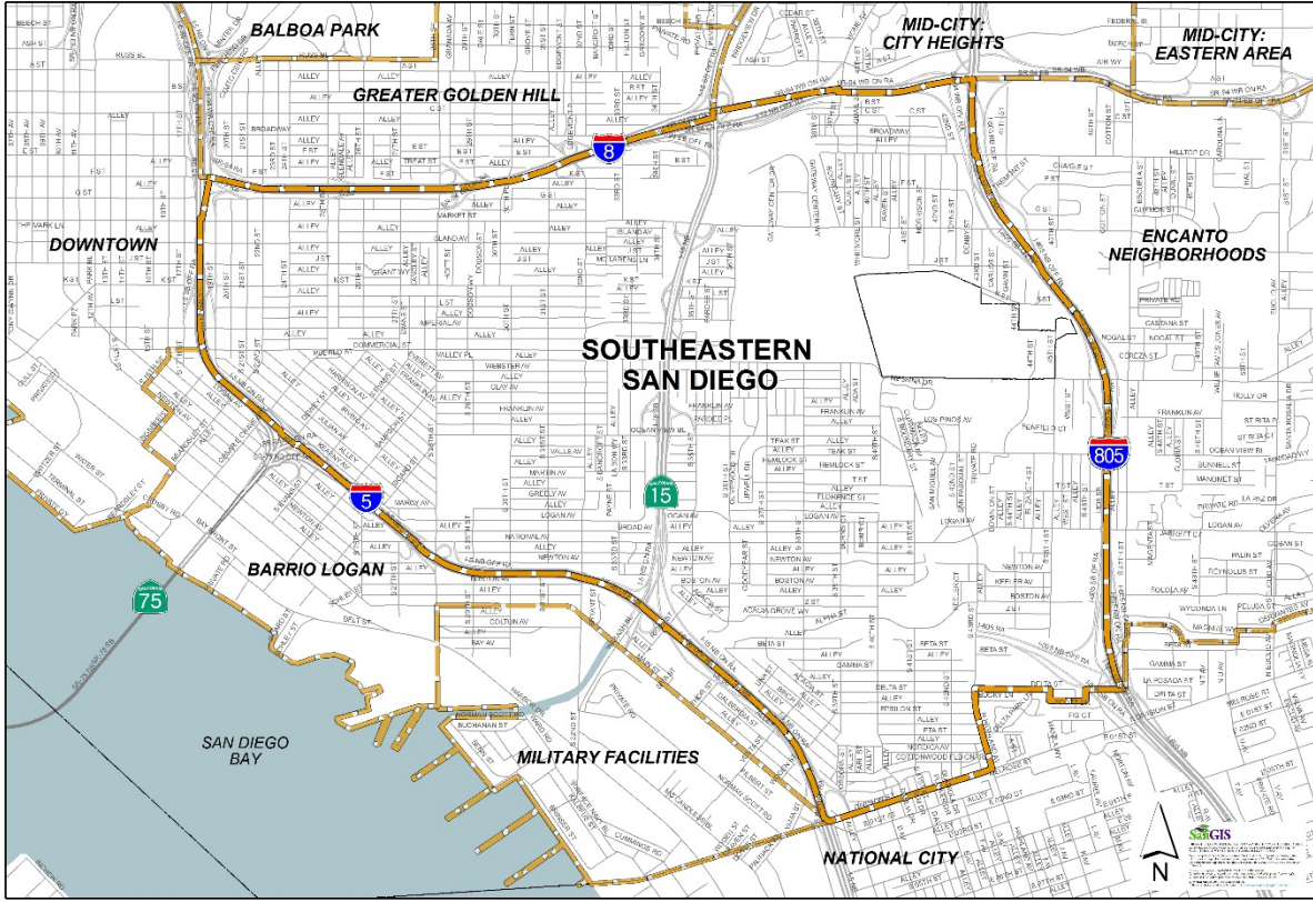
SD Exhibit A: Boundary Map - Southeastern San Diego CITY OF SAN DIEGO • PLANNING DEPARTMENT