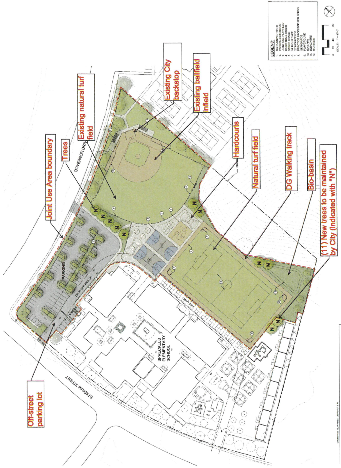
EXHIBIT "A" GENERAL DEPICTION OF THE JOINT USE AREA