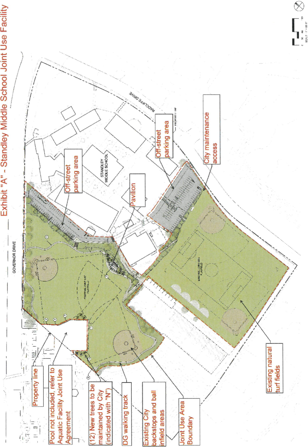
Exhibit "A" - Standley Middle School Joint Use Facility