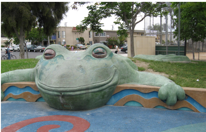
North Park Community Park children's play area Frog.