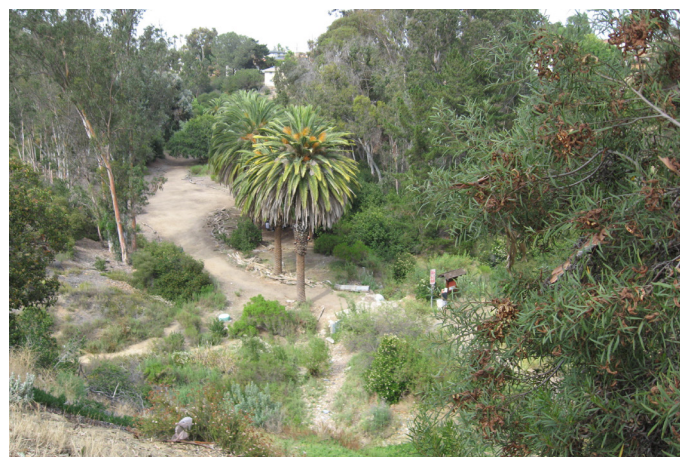
Overview of the trail system in Switzer Canyon Open Space.

Accessibility to facilities also means the availability of active and passive recreation to all residents. Organized sport leagues can make use of the facilities at specific times while making the facilities available at other times for unstructured play and impromptu users. The schedule is adjusted each year to make sure a balance is