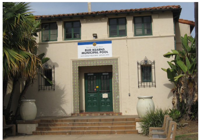
Bud Kerns Pool House, within Balboa Park, to be expanded to provide an aquatic complex for the North Park community.