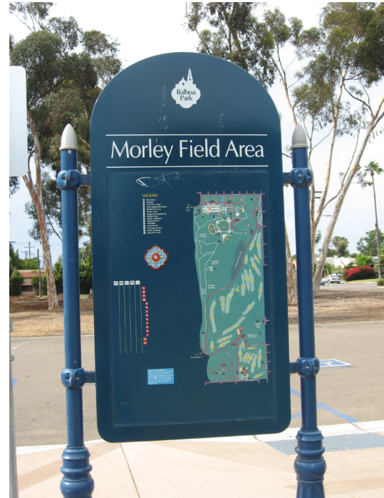
Kiosks in Morley Field provide way-finding information about pedestrian, bicycle and transit routes.