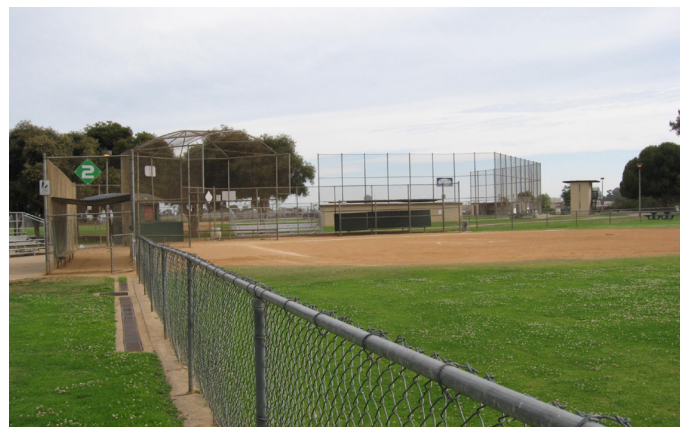
Morley Field, within Balboa Park, provides several ball fields and areas for soccer.