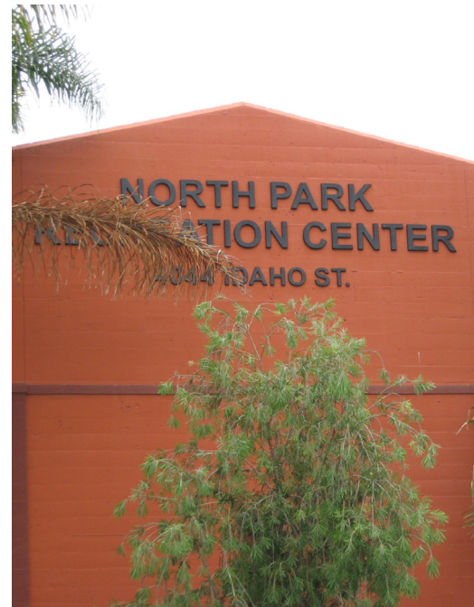
North Park Community Park Recreation Center to be expanded to provide additional multi-purpose community rooms.

There are six categories of population-based parks: 1) Major Park; 2) Community Park; 3) Neighborhood Park; 4) Mini-Park; 5) Pocket Park or Plaza; and 6) Special Activity Park. A recreation center, typically 17,000 square feet in size, should be provided for every 25,000 residents, and an aquatic complex should be provided for every 50,000 residents. The General Plan Recreation Element, Table RE-2, Parks Guidelines, provides the descriptions and minimum standards for these park and recreation facilities.