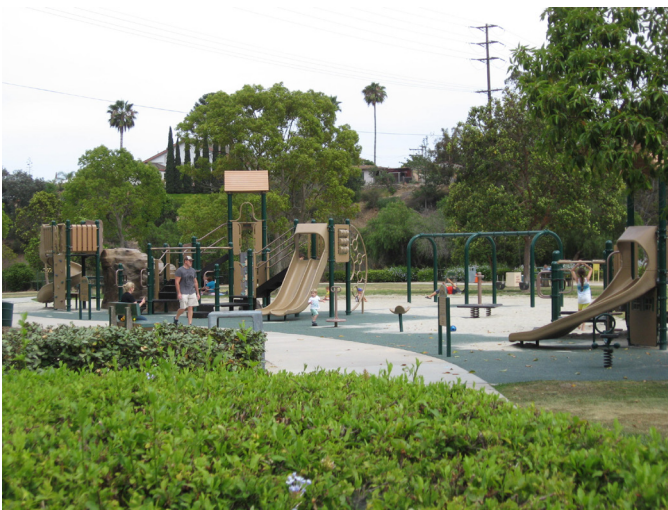
Montclair Neighborhood Park provides children's play areas and multi-purpose turf areas.

The Recreation Element includes goals and policies addressing the following topic areas: Parks and Recreation Facilities, Preservation, Accessibility, and Open Space Lands and Resource-based Parks. These goals and recommendations, along with the broader goals and policies of the General Plan and the Balboa Park East Mesa Precise Plan (BPEMPP), provide a comprehensive parks strategy intended to accommodate the community at full community development. In addition to soliciting public input through various stakeholder meetings and the community plan update advisory committees, in 2011, the City commissioned a Park and Recreation Needs Assessment for the Golden Hill, North Park, and Uptown Communities. The assessment was conducted by an independent research company to determine how and where the communities currently recreate, their priorities and preferences for future recreational uses and facilities within their communities, as well as consideration of Balboa Park as a recreational resource. The survey results, which were representative of the broad and demographically-diverse communities' recreational use patterns and opinions, were contained in a report presented to each community, and have been incorporated into this plan where appropriate. (See Appendix A for a summary of the Park and Recreation Needs Assessment.)