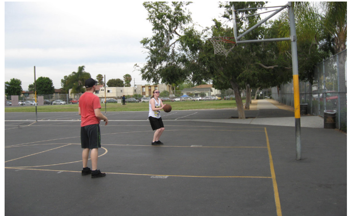
Garfield Joint Use Facility features passive lawn areas and basketball courts.

Preservation can also include the enhancement of resource-based parks and open space lands that provide a balance between protecting the natural resources and allowing for a certain level of public recreation use. Within North Park this would include concentrating active recreational use improvements towards larger resource-based parks, such as at Morley Field, and focusing passive use improvements at open space areas, such as Switzer Canyon and Juniper/34th Streets Canyons Open Space areas which are within the Multiple Habitat Planning Areas (MHPA). Aside from trails, only passive uses are allowed in the MHPA, therefore, to protect the natural resources and still add recreation value, interpretive signs at open space parks can educate the public about the unique natural habitat, scenic value, and the history of the place. (See the Conservation Element for additional information on preservation of natural resources.)