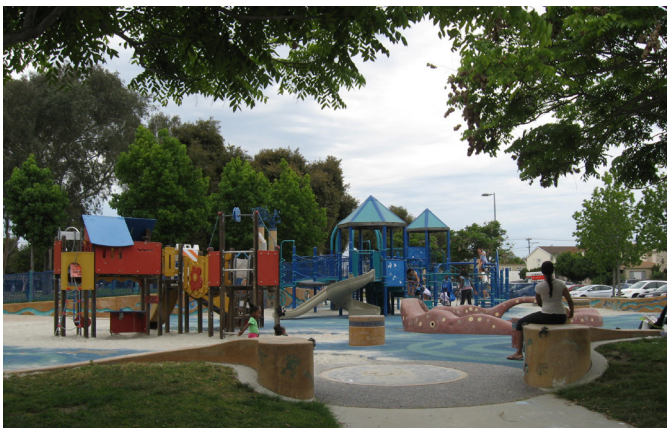
Children's play area within North Park Community Park.

The Recreation Element identifies projects that will provide all of the recreation center space and the aquatics complex facilities required to serve the community at full projected development. These proposals represent significant achievements towards implementing the General Plan and the community's goals. Staff will continue to work with community members to seek future opportunities for provision of parks and recreation facilities. In addition to the inclusion of these projects in the North Park Impact Fee Study, identification of potential donations, grants and other funding sources for project implementation will be an ongoing effort. Figure 7-1 depicts the approximate locations of existing and proposed open space, parks, recreation facilities and park equivalencies.