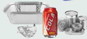
Clean aluminum and metal cans