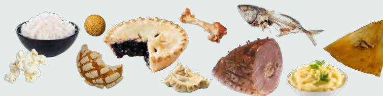
Leftover food scraps