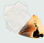
Coffee filters & soiled napkins