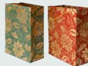
Gift bags (reuse when possible)