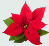
Plants (No pots - please reuse or recycle)