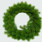
Natural wreaths & garlands (No ornaments, bows or lights)