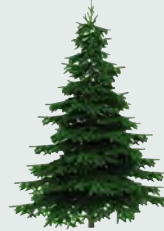
Christmas tree (cut tree so pieces fit into bin)