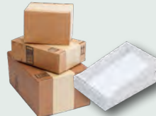
Cardboard and paper gift boxes (reuse when possible)