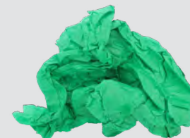
Tissue paper (reuse when possible)