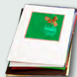
Paper greeting cards (no photo cards)