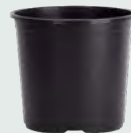
Plastic plant pot