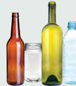
All jars, glass and plastic bottles