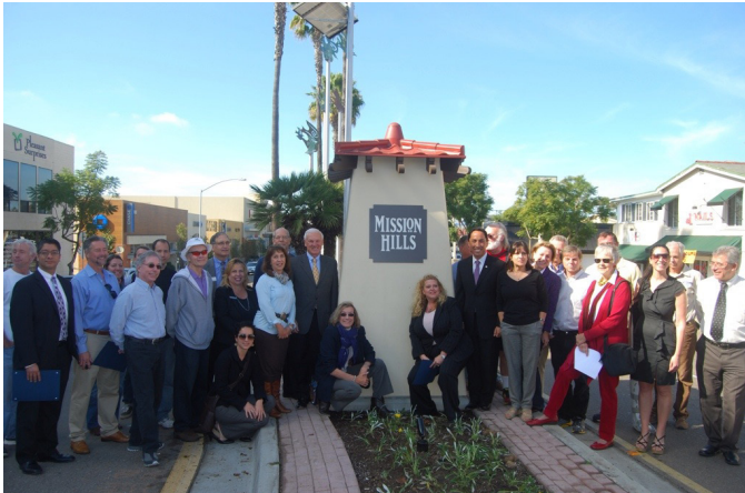
The Mission Hills BID consists of over 500 business license holders located along West Lewis Street, Fort Stockton Drive, and Goldfinch Street; the West Washington Street and University Avenue corridors; and Reynard Way and India Street's International Restaurant Row.

The community's water, wastewater, and storm water infrastructure has issues with aging, insufficient capacity, and outmoded design. The City is addressing these issues for the water and sewer systems through rate increases beginning in 2007 to replace and improve infrastructure.