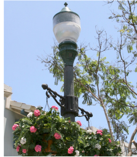
Historic "acorn" style street lighting improves safety for pedestrians, vehicles, and properties at night and is an integral component of Uptown's historic neighborhood character.