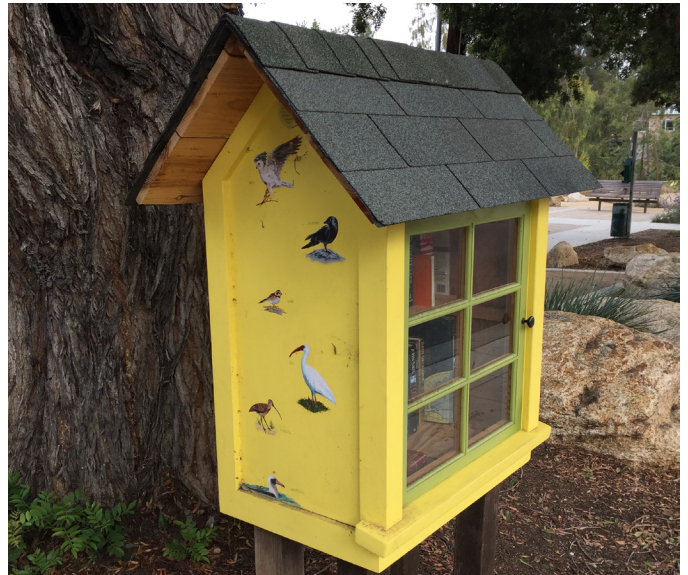
Neighborhood lending libraries such as this one on Lewis Street serve to supplement library resources and build a sense of community.

One of the most important public services is the provision of schools and the offering of quality education to the residents of the community. Schools that serve Uptown are centrally located and within walking distance to public transit. Uptown is served by five public schools: Florence, Alice Birney, and Grant Elementary Schools, Roosevelt Middle School, and San Diego High School. In addition, there are a number of charter