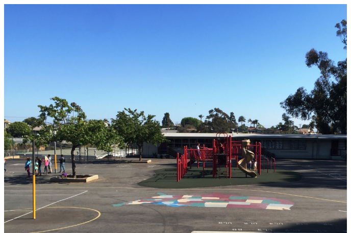
Joint-use opportunities at local public schools provide community recreational opportunities during non-school hours.