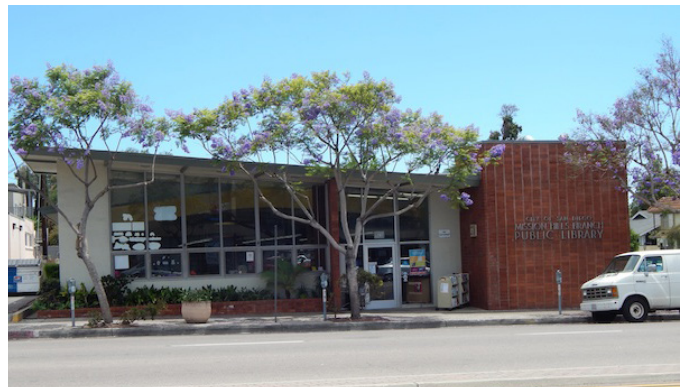
A new 15,000-square-foot facility will replace the current 3,850-square-foot Mission Hills Branch Library.