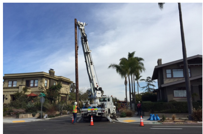
The City of San Diego works in collaboration with local utility providers to underground overhead utility lines with safer, more reliable underground utility systems.

The Public Utilities Department's Capital Improvement Program Guidelines and Standards provides the framework for the design and construction of new water facilities and addresses water efficiency, conservation, recycled and reclaimed water, cost effectiveness and timely construction.