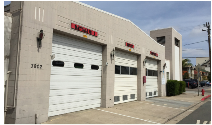
Fire Station #5 in Hillcrest is one of the busiest fire stations in the City based on the number of calls received and has been in operation since 1951.

The Fire-Rescue Department provides emergency/rescue services, hazard prevention, and safety education to ensure the protection of life, property, and the environment. This also includes education about vegetation management to protect properties from