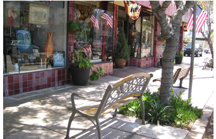
Landscaping, lighting, streetscape improvements and maintenance, security, signage/banners and street furniture are enhancements that can be provided through MADs and BID-related programs.

Storm water pollution affects human life as well as aquatic plant and animal life. Oil and grease from parking lots and roads, leaking petroleum storage tanks, pesticides, cleaning solvents, and other toxic chemicals can contaminate storm water and be transported into water bodies and receiving waters.