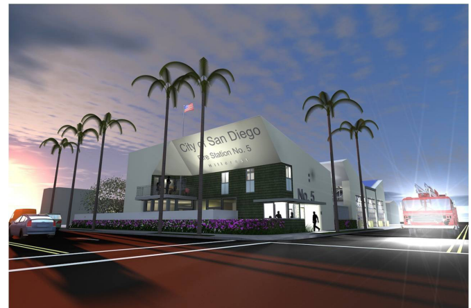
Rendering of the new replacement Fire Station #5 in Hillcrest. Image courtesy of Rob Wellington Quigley, FAIA.

wildfires in canyon areas. The Fire-Rescue Department provides service to Uptown with three fire stations. Station 8 located at Goldfinch and Washington Streets, Station 5 located at Ninth and University Avenues, and Station 3 located at State and Kalmia Streets. Maintaining a successful fire service system is a challenge due to the City's topography, fiscal constraints, and an ever-growing population. A particular fire threat in Uptown is the open space canyons, from which damaging fires have occurred in the past. The Fire-Rescue Department has an active program which promotes the clearing of canyon vegetation away from structures. The City has recognized the value of fire prevention measures to reduce pressure on the overall response system in the long term; such measures include adopting strenuous safety codes and an aggressive brush management