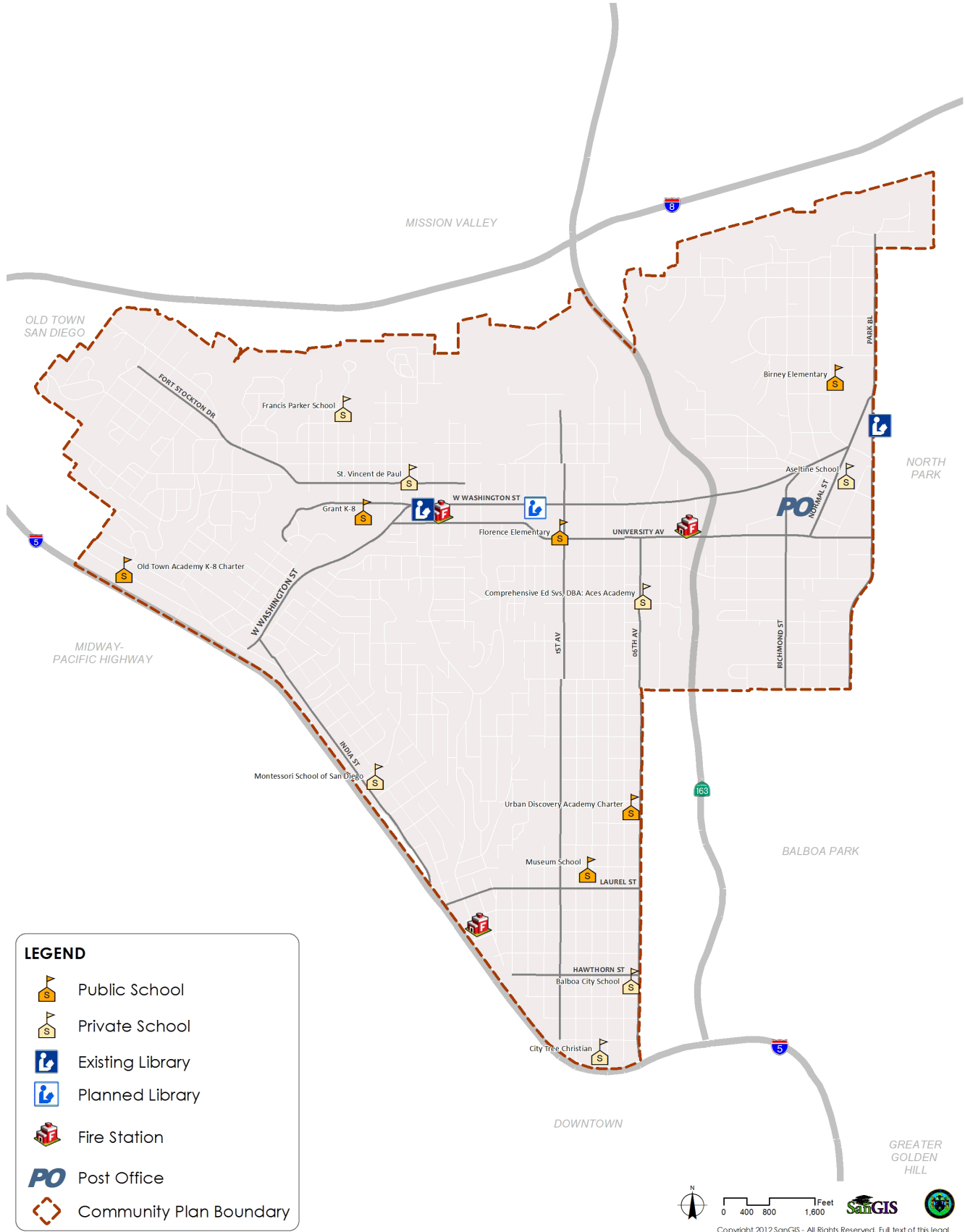
FIGURE 6-1: PUBLIC FACILITIES MAP