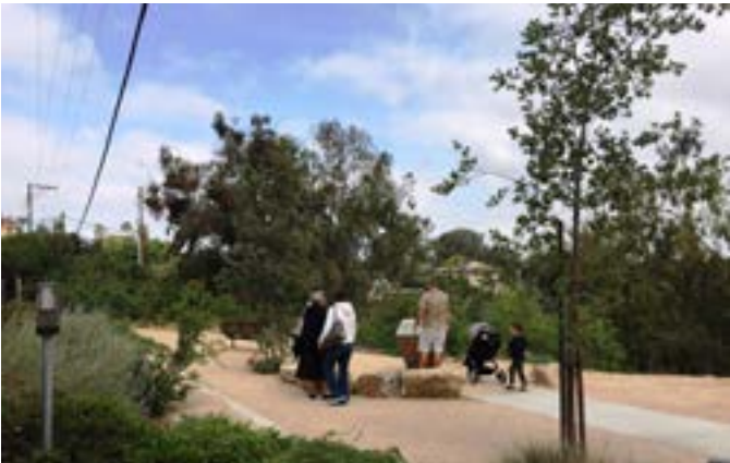
West Lewis Pocket Park provides passive recreation amenities including seating, interpretive signage and drought-tolerant landscaping.