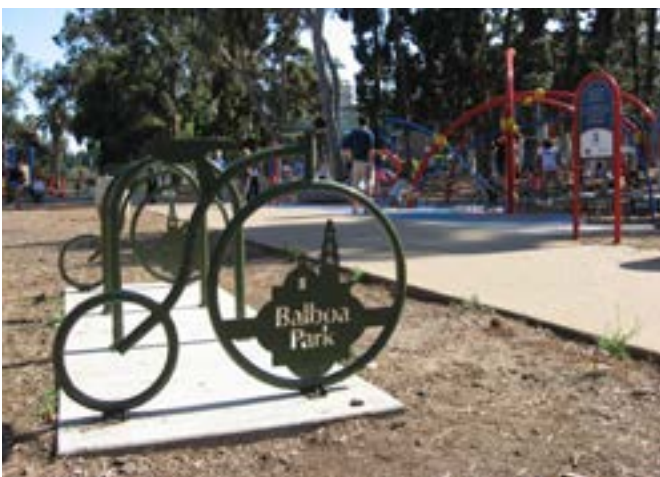
Sixth Avenue Children's Playground is located in Balboa Park and features several play areas, picnic facilities, and passive lawn areas.

The community plan identifies joint-use of the future Grant K-8 School gymnasium, and the need for two future recreation projects, at sites to be determined, that will provide all of the recreation center space required to serve the community plan at full projected development. The plan also identifies the need for an aquatic complex, at a future site to be determined. To address the park deficit of 97.14 acres staff will continue to work with community members to seek future opportunities for new parks at various sites within the community plan area. Facilities of various types and sizes will be acquired, designed, and constructed.