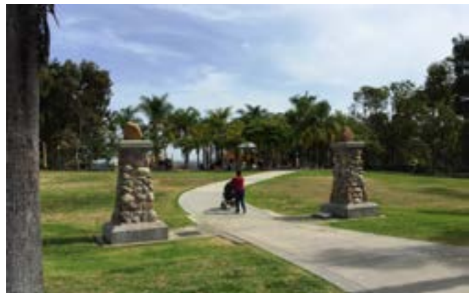
Old Trolley Barn Park is a neighborhood park that provides passive recreation and hosts community concerts and festivals.