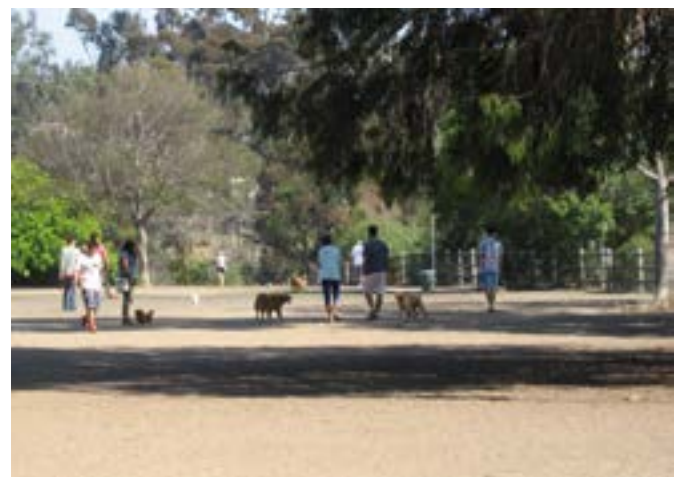
Nate's Point Off-Leash Dog Area is a popular recreation facility located within Balboa Park.