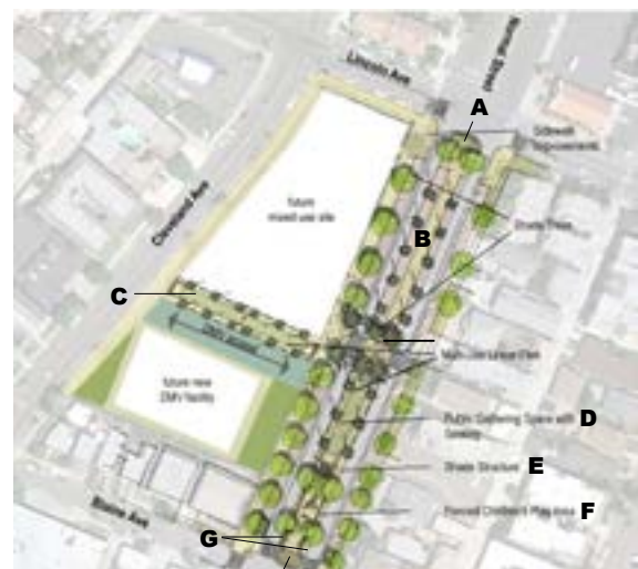
Conceptual rendering showing a redesign of Normal Street as a potential linear park.