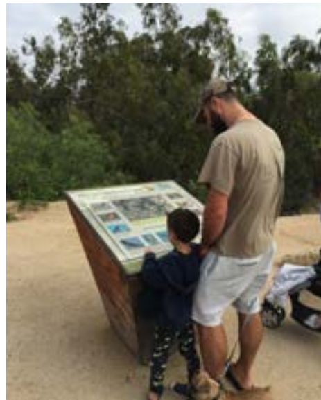
Interpretive signs and trail head kiosk signs educate the community about the biology and the cultural value of the Uptown open space system.