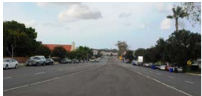
Streets with excessive right-of-way should be considered for potential recreational, urban greening, and multi-purpose opportunities.