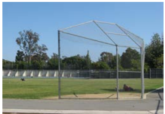
Roosevelt Middle School Joint Use Facility provides play fields, a walking track and tennis courts.

Aquatic Complex: serves population of 50,000: 58,870 people divided by 50,000 people = 1.18 Aquatic Complexes