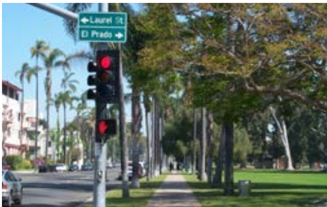
The West Mesa of Balboa Park lies adjacent to the Bankers Hill/Park West neighborhood of Uptown.

consistent with the Balboa Park Master Plan to meet existing and future demand. Use sustainable methods and materials (such as native and low-water using plants), and “green” technology that also respects any historical significance of the area.