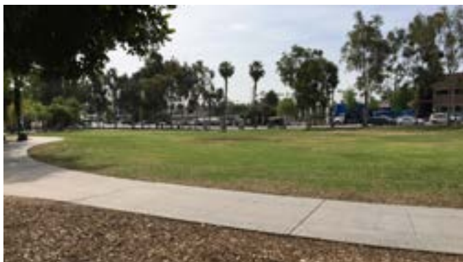
Park and recreation facilities should provide accessible pathways from the public sidewalk or from parking areas.

Resource-based parks are located at sites of distinctive natural or man-made features and serve the citywide population and visitors alike. Balboa Park is an approximately 1,200-acre regional facility contiguous to the southeastern edge of Uptown, as well as to the Downtown, North Park, and Golden Hill Communities, which contains specialty gardens and horticultural interests, and houses numerous arts, educational, recreational, social and sports organizations, primarily on the Central Mesa. The adopted Balboa Park Master Plan provides policies for the future development and enhancements within the western area of the park, located between Sixth Avenue and State Route 163, and Upas Street and Interstate 5. The Balboa Park Master