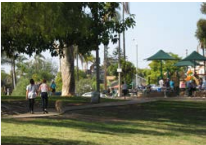
Pioneer Memorial Park in Mission Hills features large multi-purpose fields, children's play areas and picnic facilities.

In addition to soliciting public input through various stakeholder meetings and the community plan update advisory committees, in August of 2011, the City commissioned a Park and Recreation Needs Assessment for the Golden Hill, North Park and Uptown Communities. The assessment was conducted by an independent research consultant to determine how and where the communities currently recreate, their priorities and preferences for future recreational uses and facilities within their communities, as well as, consideration of Balboa Park as a recreational resource. The assessment consisted of an objective, statistically-valid, random telephone survey. The survey results, which were representative of the broad and demographically-diverse communities' recreational use patterns and opinions, were contained in a report presented to each community, and have been incorporated into this plan update where appropriate. (See Appendix A for a summary of the Park and Recreation Needs Assessment Survey).