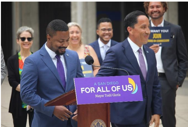
Press conference event w/ Mayor Gloria and various members of City advisory boards to formally announce the launch of the new clerk-based system "OnBoard" (July 2021)