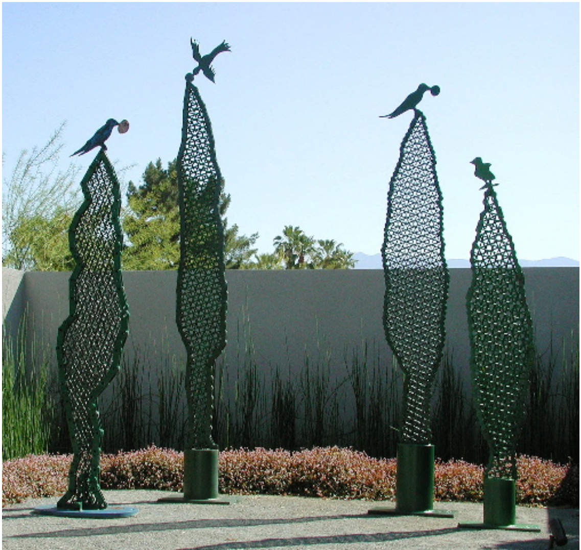
Untitled Tree 10 [Bird], green and blue painted carbon steel and chain, 2000 (far left)