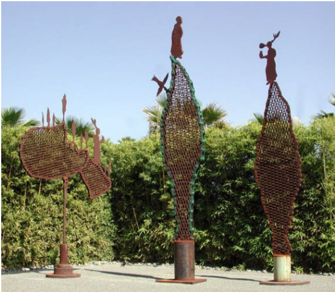
Untitled Tree 11 [Bird], carbon steel and chain, 87" x 24" x 15", 1998 (left)

He lived and had two studios in San Diego (Pacific Beach and later off of Morena Blvd.), California, and achieved most of his fame after the age of 50, but died at age 69 in 2001.