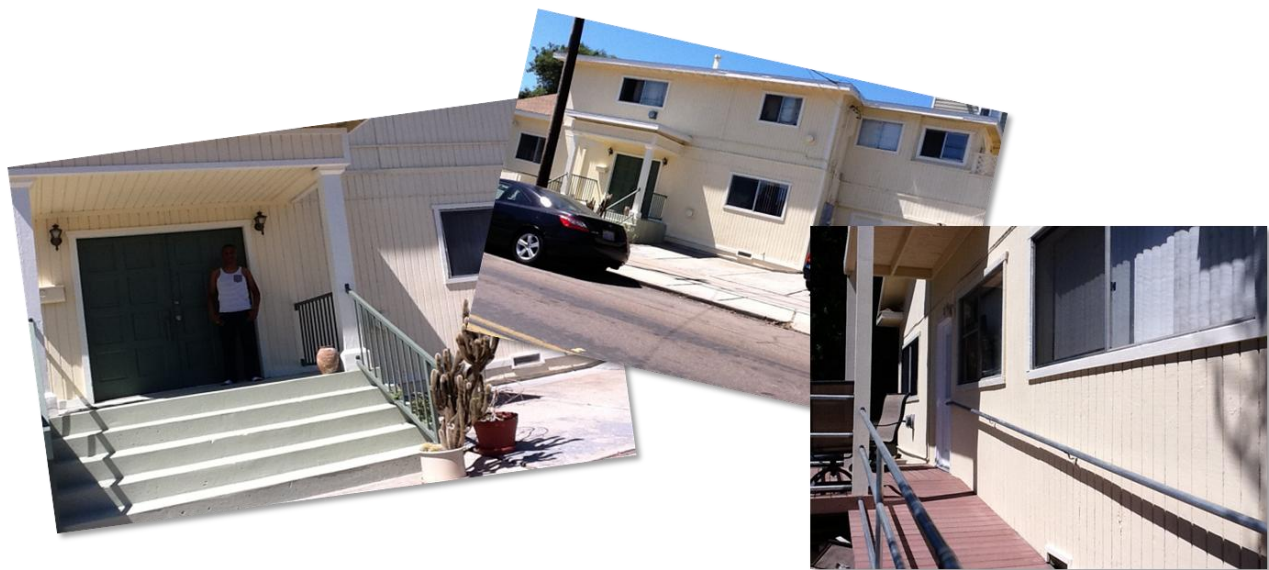
Image 11. A transitional housing site, renovated in FY 2012 using HOPWA funds, for recovering substance abusers and recovering substance abusers who have mental illness.

Collaborative Efforts: The County of San Diego, on behalf of the City, has worked closely with the Regional Continuum of Care Committee, which is jointly sponsored by the San Diego HIV Health Services Planning Council and the County of San Diego HIV Prevention Community Planning Board, and includes over 50 community-based organizations, government agencies, and