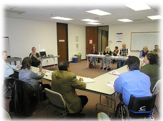
Image 12. A meeting of the Mayor's Committee on Disability.

In FY 2012, the City committed approximately $1.5 million from the General Fund to ADA projects, leveraging $99,000 in CDBG funds. These funds went to eight capital improvement facility projects at various City parks, community centers, libraries, and to public right-of-way improvements for curb ramps, missing sidewalks, and audible pedestrian signals.