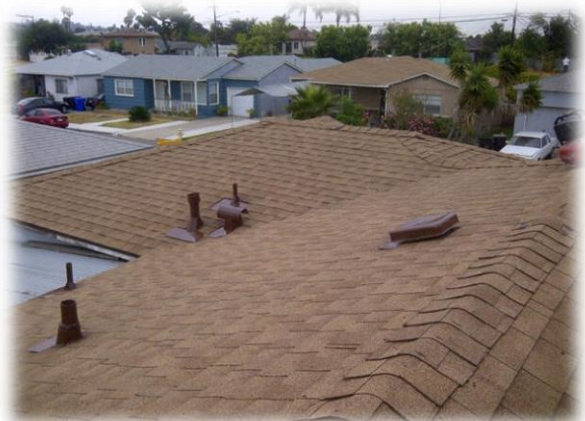
Image 7. A new roof installed in FY 2012 by a non-profit organization using CDBG funds.