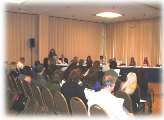
Image 1. Members of the public listening to a staff presentation during a Consolidated Plan Advisory Board meeting in September 2012.

Besides CPAB, the City and/or its partner agencies (the San Diego Housing Commission and the County of San Diego) engaged and received feedback from the public and other community stakeholders in FY 2012 regarding the implementation of its HUD-funded programs through active participation in various collaborations and public bodies, such as the Regional Continuum of Care Council on Homelessness, the Joint City/County HIV Housing Committee, the San Diego HIV Health Services Planning Council, the City Council’s Public Safety and Neighborhood Services Committee, and the Board of the San Diego Housing Commission.