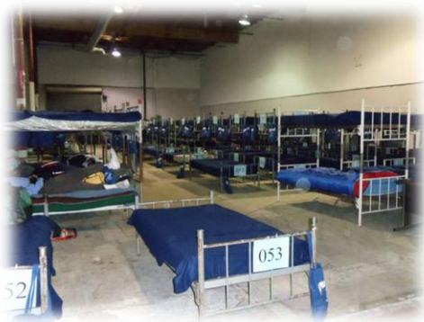
Image 5. Winter season beds for homeless single adults, funded in part by ESG and CDBG monies in FY 2012.

Goal 3 (Priority 6a in FY 2012) of the City’s Con Plan is to provide shelter for persons who are homeless and assist them in moving out of homelessness. Objectives include operating shelters and assisting families with access to transitional housing, case management, and support services. Refer to Appendix D to review Goal 3 and all of the associated objectives and outcomes.