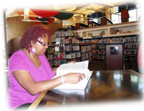
Image 3. A citizen reviewing the Draft FY 2012 CAPER in a City branch library.

In FY 2012, the City and its partner agencies (SDHC and County of San Diego) engaged and received feedback from the public and other community stakeholders regarding the implementation of its HUD-funded programs through active participation in various collaborations and public bodies, such as CPAB, the Regional Continuum of Care Council on Homelessness, the Joint City/County HIV Housing Committee, the San Diego HIV Health Services Planning Council, the City Council's Public Safety and Neighborhood Services Committee, and the Board of the San Diego Housing