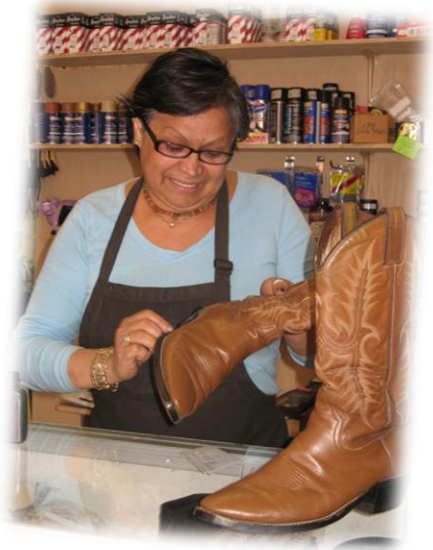
Image 6. A small business owner who received a loan in FY 2012 made possible in part by CDBG.

The City’s CDBG Program Office handles certifications of consistency with the Con Plan for agencies applying for other HUD funding. Certifications are handled in a fair, impartial, and timely manner. The City has taken no action to hinder the implementation of the Con Plan and has actively implemented related projects and programs that aid in achieving the goals and objectives of the