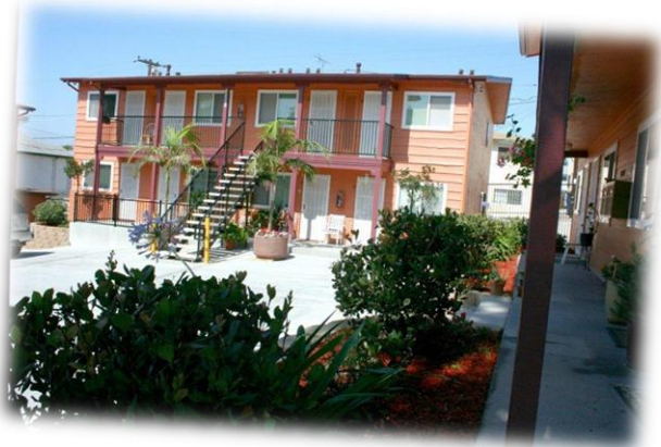
Image 10. A HOPWA-supported apartment complex for persons living with HIV/AIDS.

Needs/Statistics: A 2012 Key Data Findings report completed by the San Diego HIV Health Services Planning Council states that the cumulative number of AIDS cases reported through December 31, 2011 was 14,805. The rate of new AIDS cases has decreased or leveled off since 1993. However, the number of people living with AIDS continues to increase each year (although at a slower or level rate) as people with AIDS live longer. Five hundred twenty-five new cases were reported in San Diego County between January 1, 2010, and December 31, 2011.