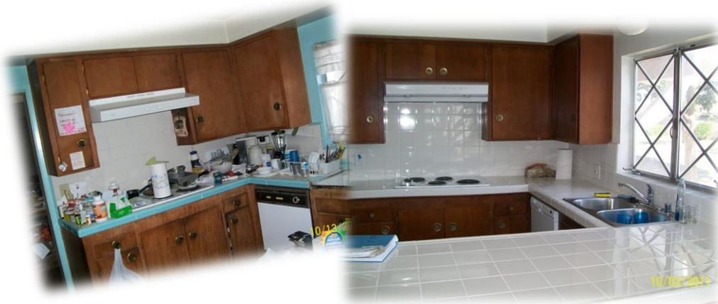
Image 4. Before (left) and after (right) photos of a home interior rehabilitation that used HOME funds.

Eighteen of the 24 homes were rehabilitated by minority-owned and operated businesses.