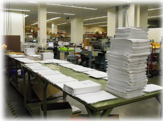
Image 2. Draft FY 2012 CAPER in production.

The public review period on the draft CAPER began on September 4, 2012, and comments were accepted through September 19, 2012. Notice of the availability of the draft CAPER for review and comment was published in both English and Spanish in four community newspapers (refer to Appendix A for proof of publication) and on the City's CDBG website. The full draft CAPER was made available on the City's CDBG website, and SDHC posted links on its website to the report and associated public notice. Staff distributed hardcopies of the draft CAPER to Council members, to CPAB members, at eight different City branch libraries and community centers primarily serving low- and moderate-income communities, and at the front counters of the City's CDBG Program Offices and the