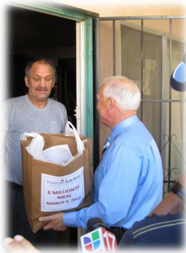
Image 9. A person receiving a home-delivered meal made possible by HOPWA funds.

The City is the HOPWA program grantee. Through a contract agreement with the San Diego County Department of Housing and Community Development (HCD), the County of San Diego has assumed all administrative responsibilities for the HOPWA program. In addition to the Countywide HOPWA program, HCD operates housing programs in the unincorporated areas and in 15 of the 18 cities within San Diego County. HCD provides housing assistance and community improvements through programs that benefit low- and moderate-income persons.