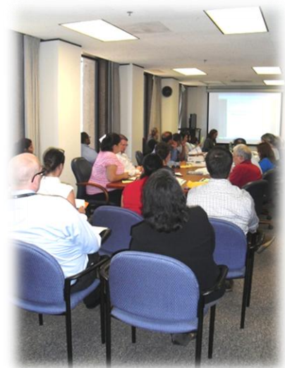
Image 8. Workshop for agencies receiving CDBG funding.