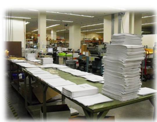
Image 5. Draft CAPER in production at the City's Publishing Services Division's print shop.

Comments and questions received during the review period are included in this CAPER as Appendix B. Members of the public, service providers, City Council staff, City Council members, and CPAB members provided comments and questions to staff via e-mail, telephone, and orally at public meetings. The comments and questions received involved advocating for the allocation of resources to youth programs and women military veterans, the use of CDBG program income from repayments by the former Redevelopment Agency, minor textual edits to correct errors, and requests for general clarification and additional information on the CAPER.