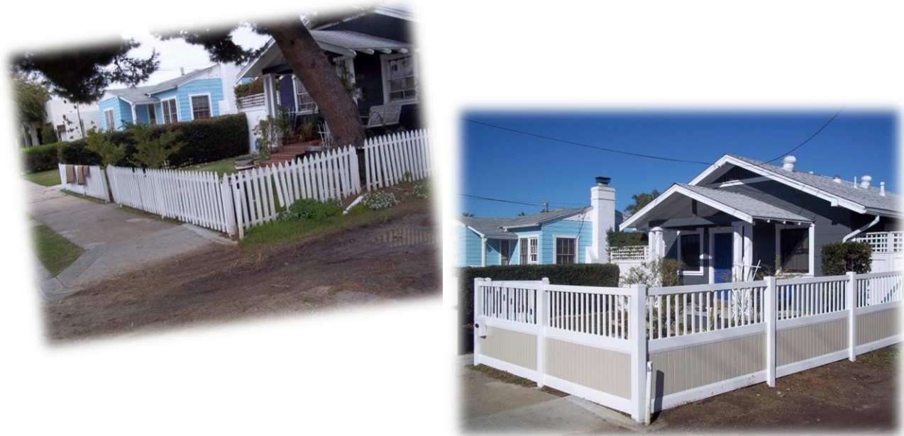
Image 11. Before (left) and after (right) photos of a home exterior rehabilitation that used HOME funds.

Four of the 10 homes were rehabilitated by minority-owned and -operated businesses.