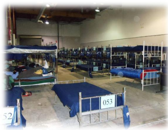
Image 12. Winter season beds for homeless single adults, funded in part by ESG and CDBG monies in FY 2013.

Goal 3 (Priority 3B in FY 2013) of the City’s Con Plan is to provide shelter for persons who are homeless and assist them in moving out of homelessness. Objectives include operating shelters and assisting families with access to transitional housing, case management, and support services. Refer to Appendix D to review Goal 3 and all of the associated objectives and outcomes.