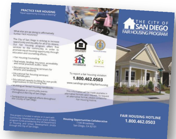
Image 2. A copy of the fair housing brochure developed by the City in FY 2013. It is available in English, Spanish, Tagalog, Vietnamese, and Chinese.

In addition, Objective 12.2 of the Con Plan was refined to incorporate additional outcomes regarding fair housing that were developed in consultation with its fair housing service contractors. The additional outcomes enhance the City's ability to measure its progress on furthering fair housing knowledge, practices, and enforcement throughout its HUD-funded projects and programs.