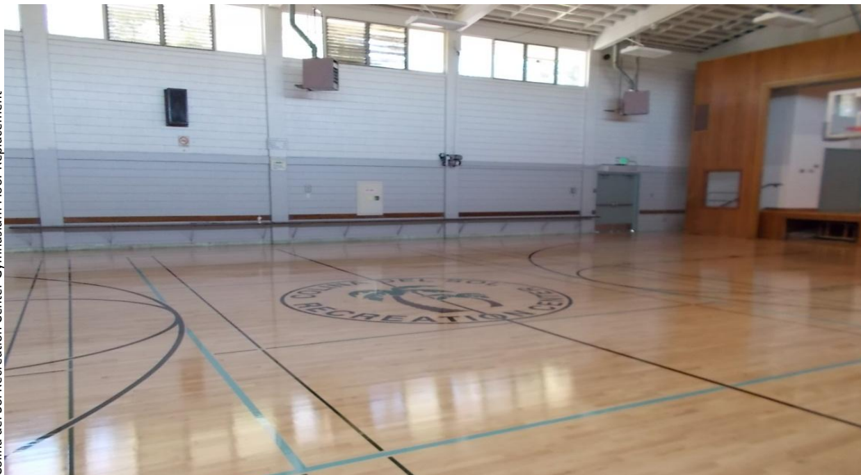
Colina del Sol Recreation Center Gymnasium Floor Replacement