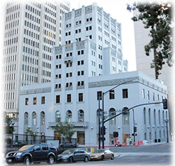
Image 4. Connections Housing in downtown San Diego.

Shelters and Interim Beds for Homeless Adults : Fiscal Year 2013 heralded the long-awaited opening of Connections Housing, a site which offers interim and permanent housing for homeless individuals, as well as services and healthcare. Although this new housing offered additional shelter opportunities for homeless individuals on the streets of San Diego, it was determined that there was still a need for the seasonal shelters, which serve veterans and single adults. Both shelters opened for four months during the winter months; however, the City decided to extend the shelters to the end of FY 2013. A combination of funding sources was used in FY 2013 to set up and operate the seasonal shelters, which included $235,000 in CDBG funds, $164,954 in ESG funds, and $550,000 in General Funds.