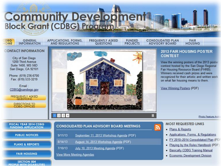
Image 7. A screen shot of the home page of the City's CDBG website featuring an affordable housing poster contest.

In FY 2013, the City continued to update its CDBG website as to design and content to make it more visually appealing and user friendly. A page continued to be dedicated to fair housing issues and information. The page features the Fair Housing Hotline (1-800-462-0503) that citizens may call if they believe they have been denied housing or the opportunity to apply for housing in the City because of being in a protected class. The page also features monthly calendars of fair housing-related events, issues of the City's Practice Fair Housing newsletter, and the City's fair housing informational brochure available in five languages (English, Spanish, Tagalog, Chinese, and Vietnamese). In addition, a page dedicated to Section 504 of the Rehabilitation Act of 1973, which prohibits discrimination on the basis of disability in programs and activities conducted by HUD or that receive financial assistance from HUD was launched. The website provides information on how any person with a disability who feels himself or herself a victim of discrimination in a HUD-funded program or activity may file a complaint with the City's Section 504 Administrator. Staff will continue to work on updating the website's content and featuring projects and activities funded by CDBG, HOME, HOPWA, and ESG to showcase the accomplishments of the City in implementing its Con Plan by using HUD funds and other resources.