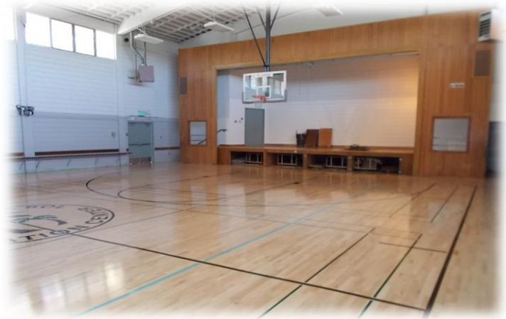
Image 14. Newly installed gymnasium floor at a City recreation center made possible by CDBG funds.

No CDBG-funded projects were conducted during FY 2013 that required displacement or relocation of households, businesses, farms, or non-profit organizations subject to the Uniform Relocation Act or Section 104(d) of the Housing and Community Development Act of 1974.