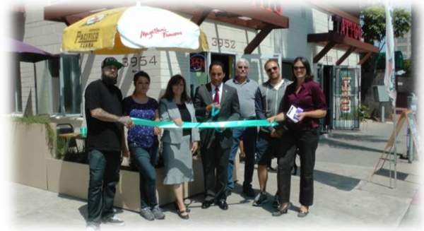
Image 3. A ribbon-cutting ceremony for a small business in Hillcrest that participated in the Storefront Improvement Program.