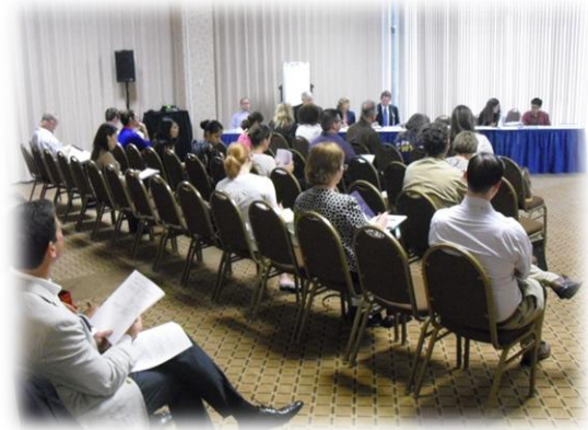
Image 1. Members of the public and staff attending a Consolidated Plan Advisory Board meeting in July 2013.

Besides the CPAB, the City and/or its partner agencies (the San Diego Housing Commission and the County of San Diego) engaged and received feedback from the public and other community stakeholders in FY 2013 regarding the implementation of its HUD-funded programs through active participation in various collaborations and public bodies, such as the City Council, the City Council’s Public Safety and Neighborhood Services Committee, the Board of the San Diego Housing Commission, the Regional Continuum of Care Council (on homelessness), the Joint City/County HIV Housing Committee, and the San Diego HIV Health Services Planning Council.