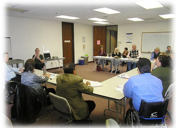
Image 19. A meeting of the Mayor's Committee on Disability.

In FY 2013, 11 ADA capital improvement projects were completed, funded with various sources, including land sales, development impact fees, and CDBG. At the end of the FY 2013, 90 ADA capital improvement projects were at various stages of progress, such as design, bid, and construction. The public may now monitor ongoing ADA capital improvement projects through the website of the City's Capital Improvements Program at http://www.sandiego.gov/cip/projectinfo/index.shtml .