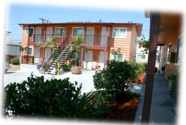
Image 17. A HOPWA-supported apartment complex for persons living with HIV/AIDS.

Needs/Statistics: A 2013 Key Data Findings report completed by the San Diego HIV Health Services Planning Council states that the cumulative number of AIDS cases reported through December 31, 2012 was 15,028. The rate of new AIDS cases has decreased or leveled off since 1993. However, the number of people living with AIDS continues to increase each year (although at a slower or level rate) as people with AIDS live longer. Four hundred forty-one new cases were reported in San Diego County between January 1, 2011, and December 31, 2012.