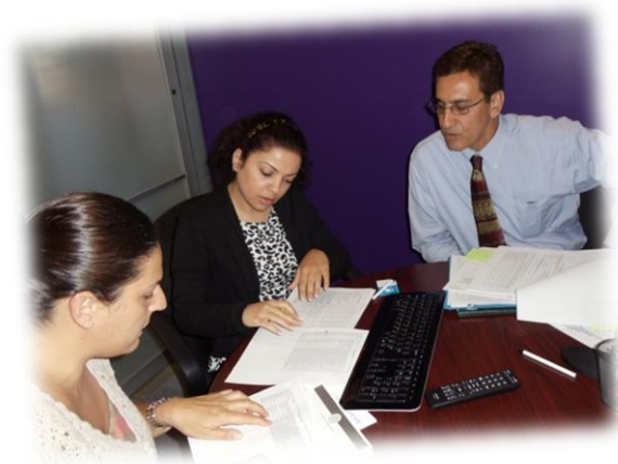
Image 9. CDBG staff conducting monitoring and a site visit with a funded agency.

During FY 2013, fiscal desk audits were conducted on the majority of the CDBG requests for reimbursement submitted. Additionally, there were 13 fiscal onsite visits to review the records of subrecipients (visits focused on review of fiscal/budgetary matters), and no major issues were noted. All questioned costs and concerns were corrected in a timely manner by the subrecipients. Also during FY 2013, 111 general site visits and/or program monitoring visits were conducted. These visits ensured program compliance and the provision of needed technical assistance to subrecipients.