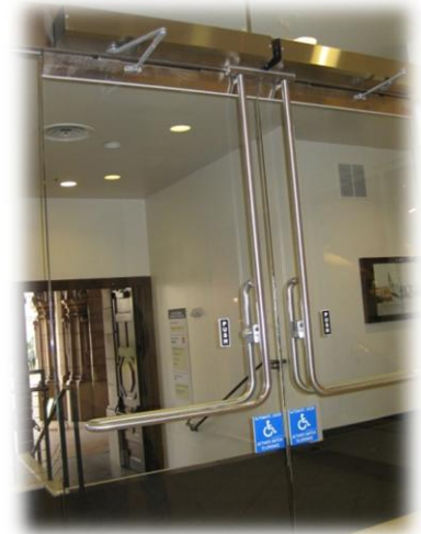
Image 15. An ADA improvement in Balboa Park funded by CDBG.

Table 22 below shows the CDBG projects that were implemented in FY 2013 pursuant to Goal 2 to address non-homeless special needs. Refer to Appendix G for a full narrative description of each project’s accomplishments in FY 2013. Refer to Appendix H for project tables showing the goals established for each project, the actual accomplishments, a description of the project, how much funding was allocated to the project, and the actual amount expended.