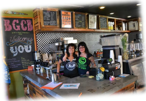
Image 13. Small business owners who received a loan in FY 2013 made possible in part by CDBG.

Note that Goal 7, as originally formulated (refer to Outcome 7.2.2), encompasses facilities (in addition to housing ) that benefit low- and moderate-income persons. These facilities, for example, include, but are not limited to, recreational buildings, parks, community centers, health clinics, and the public right-of-way. Because of the original formulation of Goal 7 in the Con Plan that combines housing and facilities into one goal, information on such facilities are presented in the "Specific Housing Objectives" section of this Con Plan on page 34.