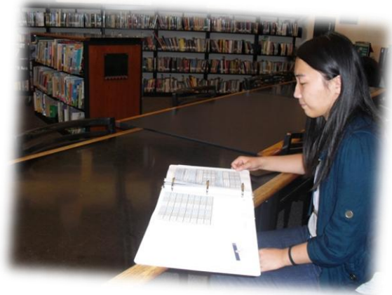
Image 6. A citizen reviewing the Draft FY 2013 CAPER in a City branch library.

Goal 1 (Priority 8 in FY 2013) of the City’s Con Plan is to improve citizen and stakeholder participation for annual action plans. Implementation and improvement of the citizen and stakeholder participation process for annual action plans is an ongoing activity in accordance with the City’s Citizen Participation Plan. Because “improving the process” is neither defined nor results in a year-end quantifiable performance outcome, citizen and stakeholder participation activities are reported in narrative form.