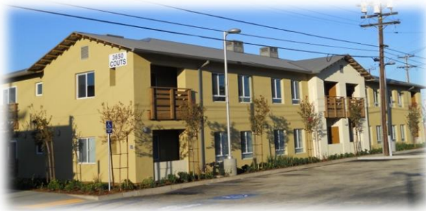
Image 10. A veterans housing complex completed in FY 2013 in part with HOME funds.

“Medium Priority” includes household and income groups at 51 to 80 percent of the AMI who are homeowners in need of housing rehabilitation, and homeownership assistance to households earning 0 to 30 percent of the AMI.