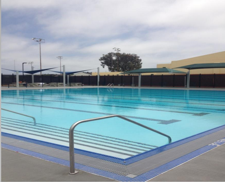
Memorial Park Pool

Thank you for funding valuable community park projects!