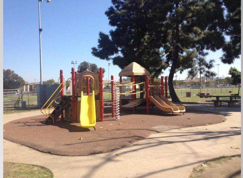
Playground replacement (2) Accessibility Improvements