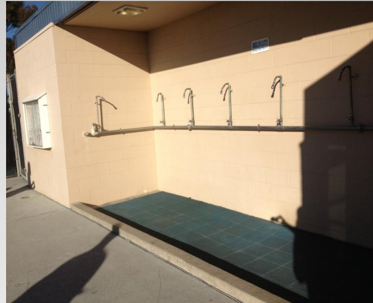
Outdoor Barrier Removal