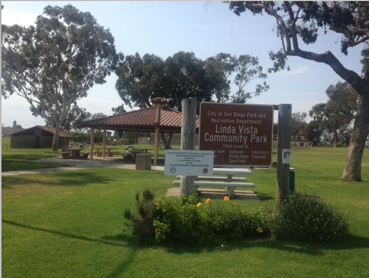
Linda Vista Picnic Shelter