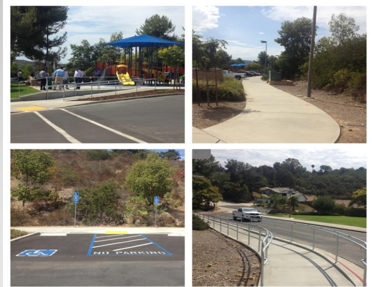
Views West ADA Improvements