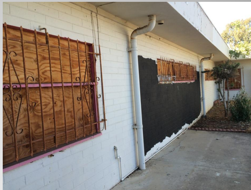
Demolition of old community center structure