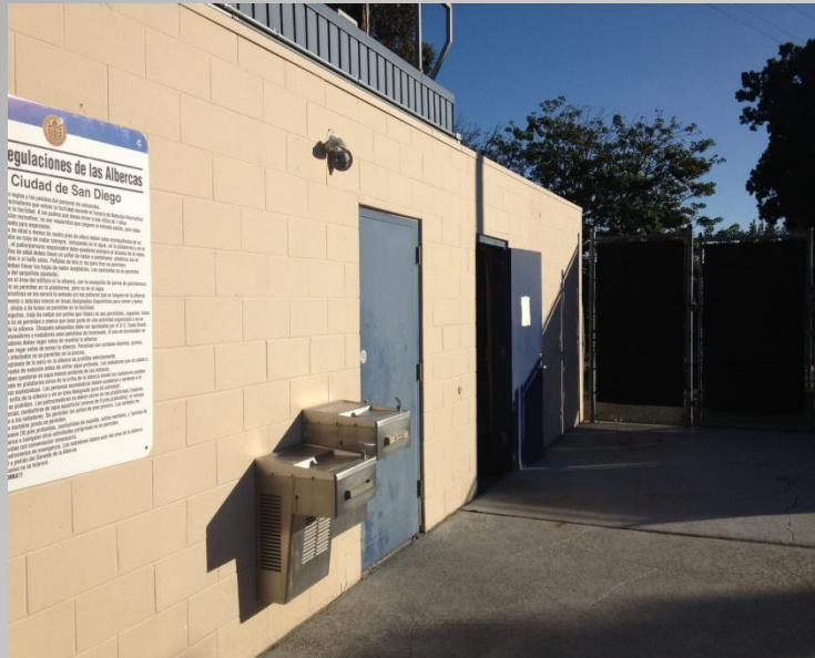
ADA Compliant Accessibility Improvements