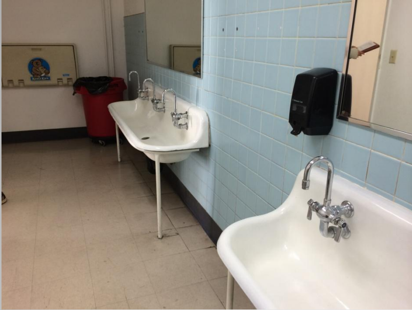
Barrier Removal Accessibility Improvements