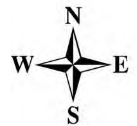
Exhibit B - 11 Upas Project Alt. 2 Pipe Pressure