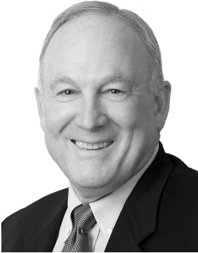
JERRY SANDERS Mayor of San Diego