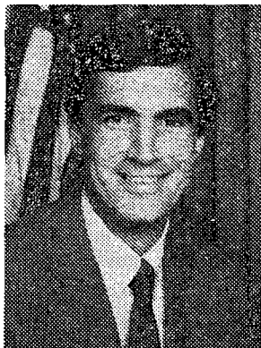
ROGER HEDGECOCK MAYOR OF SAN DIEGO