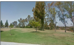
A playground is slated to be added to University Village Park at Florey Street and Cather Avenue.

Children and parents alike have been waiting a long time for a playground at the University Village Park.