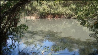
Los Peñasquitos Lagoon.

One of the most devastating aspects of the massive Sept. 8 blackout was the sewage spill that affected Los Peñasquitos Lagoon.