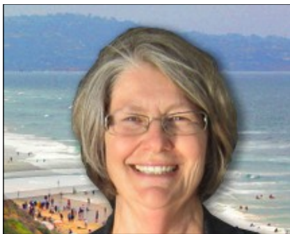
Council President Pro Tem Sherri Lightner — District 1

Twitter: www.twitter.com/#!/SherrriLightner