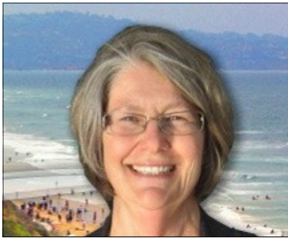
Council President Pro Tem Sherri Lightner — District 1

Twitter: www.twitter.com/#!/Sherrilightner