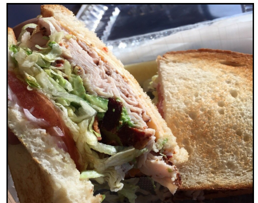
The popular Jamaican Jerk Chicken Sandwich is one of many specials offered at CrossRoads Deli.

For information: Visit www.ljxdeli.com or contact them at (858) 458-0921 or via email at CrossroadsDeliSD@Gmail.com .