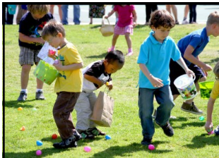
Kids enjoy the Skate Park and annual egg hunts.