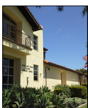
La Jolla/Riford Library will remain open after Thanksgiving.

Finally, beware of offers too good to be true. Use caution and err on the side of safety when judging whether or not an offer is a scam.