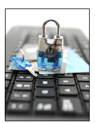
Keep your information safe this holiday season.

Watch the <u>Charter Review</u> <u>Committee meetings</u> on City TV 24, read the <u>Committee</u> <u>memos</u>, and see the <u>meeting</u> <u>schedule</u> on the City Website. Send comments to <u>charterre-</u> <u>view@sandiego.gov</u> or call (619) 236-6611.