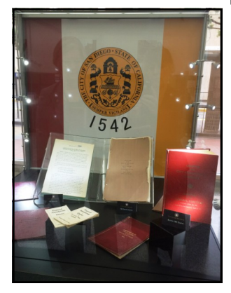
The City's original Charter is on display as part of the City's collection.

At the December 3 meeting, the Committee will consider recommendations regarding the Ethics Commission, Planning Commission, Article V sections on Executive and Administrative Services, Article VII sections on Finance, Retirement, Civil Service, Contracting, and a proposed Preamble.