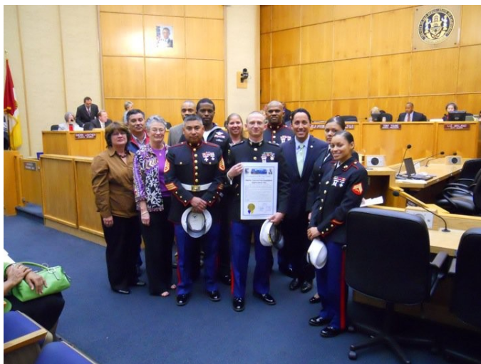
Above, Councilmember Gloria honored the Marine Corps Toys for Tots Foundation for its work at the City Council meeting on January 11.