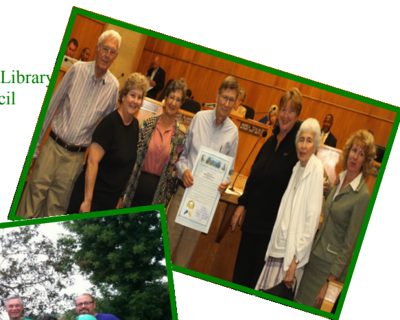
Friends of the College-Rolando Library Proclamation at City Council

The Healthy Works School and Community Gardens Program plans to provide a new solution in promoting school garden sustainability and increasing access to healthy foods in San Diego County. It is our hope this big garden will become a community asset to the San Carlos neighborhood.