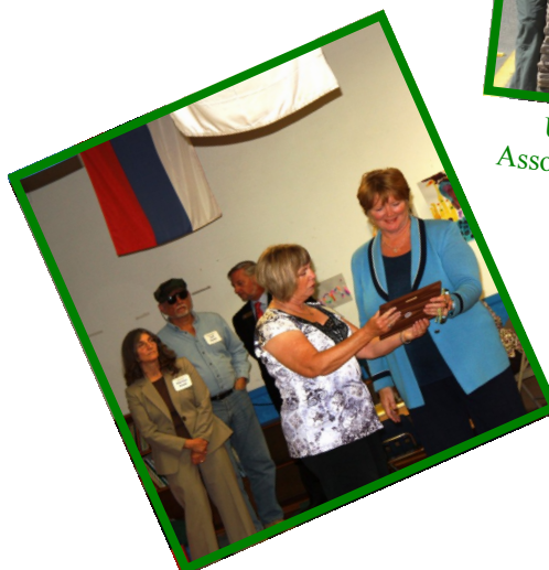
Allied Garden's Community Council's 31st Anniversary Event.