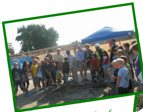
Groundbreaking at the site of the future Multi-Purpose Joint Use Fields at the Language Academy.