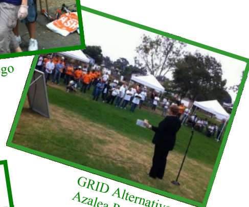
GRID Alternatives event in Azalea Park brings Solar to local homeowners.