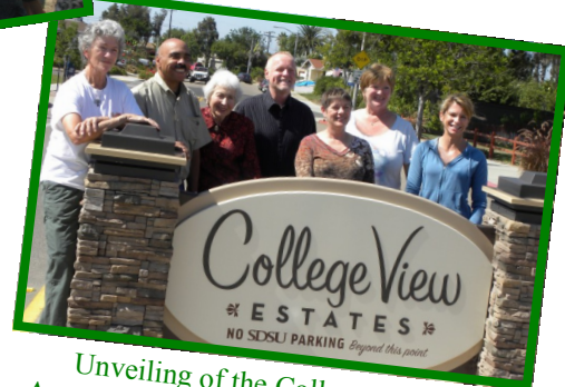
Unveiling of the College View Estates Association Welcome to the Community Sign