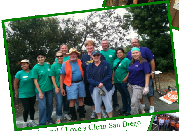
27th Annual I Love a Clean San Diego Clean Up Day at Chollas Creek.