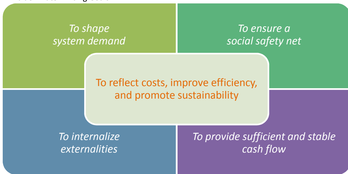
Exhibit 3. Water Pricing Goals