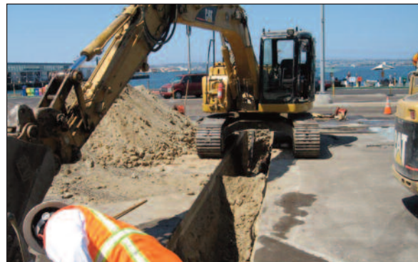
Construction crews are digging a trench for the installation of the 16" diameter pipe.