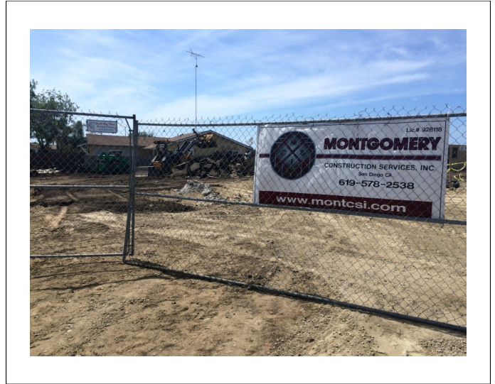
Montgomery broke ground on the temporary station in early February

The Skyline Temporary Fire Station will serve as a placeholder until a permanent station can be built for the community. The temporary station will allow the City to provide better emergency coverage in the Skyline Hills neighborhood.