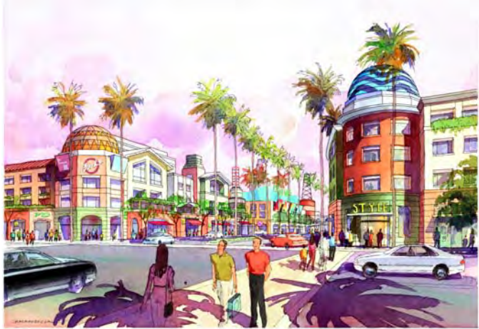
The proposed "Paseo" Project