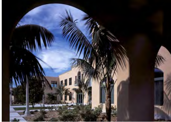
Office Building at NTC