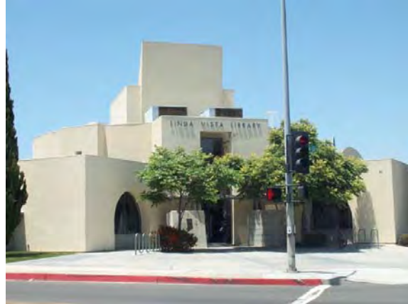
Linda Vista Library