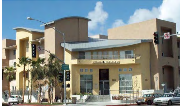
City Heights Urban Village Townhomes