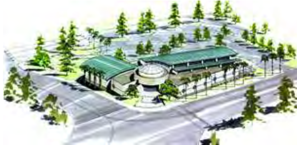
Point Loma Branch Library