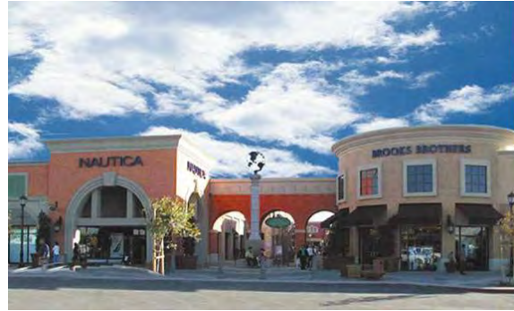
The Shops at Las Americas