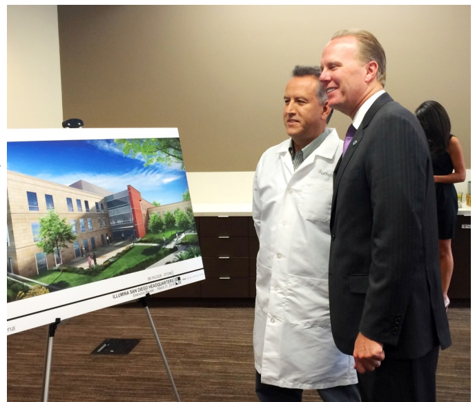
Overlooking Illumina’s expansion plans

Among the terms of the 10-year Economic Development Incentive Agreement, Illumina is eligible to apply increased sales and use tax revenue it generates over the course of the agreement toward a $1.5 million tax rebate from the City, which it would receive after the City verifies the new revenue. The City will retain 30 percent of Illumina’s sales tax revenues in addition to the current level of sales and use tax generated by Illumina – approximately $1.3 million annually in the most recent year. After the $1.5 million tax rebate cap has been reached or the term of the 10-year agreement ends, the City will return to receiving 100 percent of Illumina’s tax revenue.