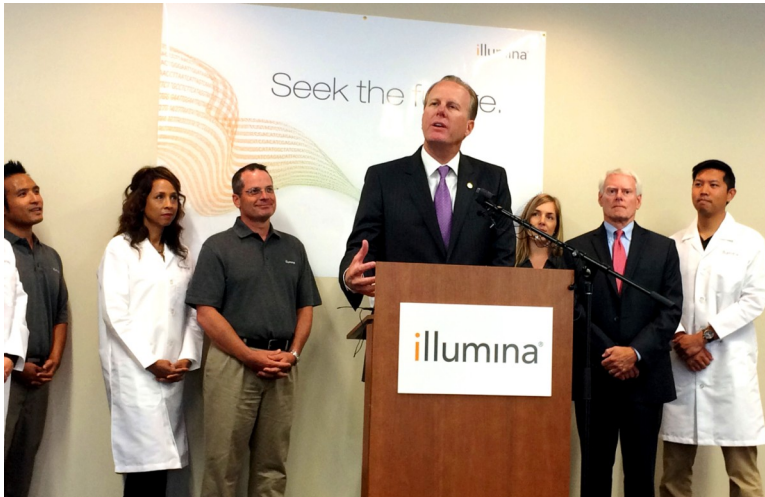
Mayor Kevin L. Faulconer addresses Illumina employees

As Illumina was considering a variety of options to expand its manufacturing operations, including locations outside the city and state, Mayor Faulconer personally visited its headquarters and began a dialogue to ensure the company chose San Diego.